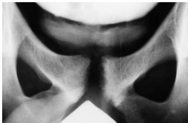
Fig. 8. Symphysisitis. Soccer player, 19 years old, with groin pain for a long time. At herniography there was no hernia but he had advanced bone changes – multiple erosions and moderate sclerosis – at the symphysis pubis.

occurred in 24 of 33 patients with normal herniography but in only 8 of 17 patients with pathological herniography (Fig.8) (chi-square test, p=0.13 ). Advanced skeletal changes were found in 21 patients. There was no difference in outcome at follow-up between patients with and without skeletal changes.