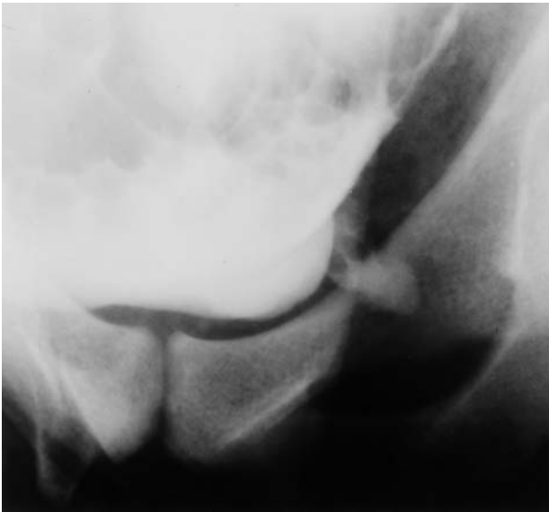
Fig. 1. Direct diverticular hernia. Soccer player, 26 years old, with pain in his left groin for 6 months. At herniography, a small direct diverticular hernia was found in his left groin. This hernia could not be found at operation but hernioplasty was performed. 17 years later the patient was asymptomatic and still exercising.

Before the examination the patient should void. 50 ml of contrast medium (iohexol 180 mg I/ml, Omnipaque; Nycomed Amersham) was injected