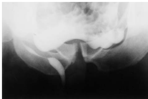
Fig. 6. Processus vaginalis. Soccer player, 26 years old, with pain in his right hip region for about 5 months. At herniography a long processus vaginalis was found. It was primarily considered to be a hernia and was operated. Finally, the symptoms were considered to emanate from the skeleton.