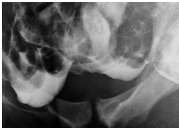
Fig. 3. Broad-based direct inguinal hernia. Soccer player, 26 years old, with pain in his left groin. Herniography showed a broad-based direct inguinal hernia on the contralateral side. Advanced bone changes at the pubic symphysis – erosions and beaking – are seen as well. He was not operated on but was asymptomatic and still training at the follow-up 3 years later.