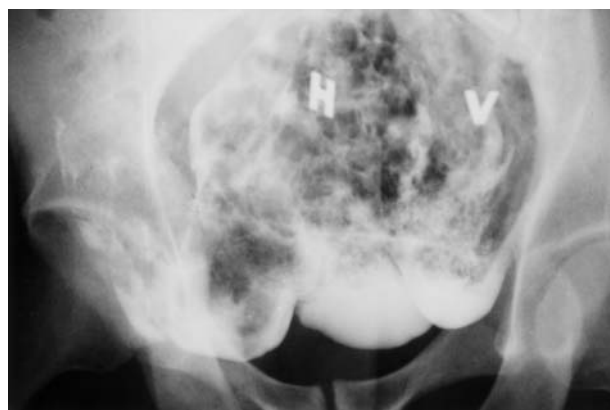
Fig. 5. Groin insufficiency. Soccer player, 23 years old, with pain in his left groin for about 6 months. Herniography showed groin insufficiency most pronounced on the contralateral side. The patient is still exercising 19 years after herniography and he has fewer symptoms than before.

Most of the 29 patients who have answered our questionnaire have become asymptomatic (Table 2) and they were exercising on average 10 years after herniography. There were more asymptomatic patients among those who had pathological hernio-