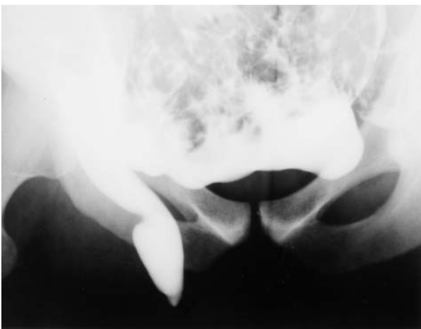
Fig. 2. Indirect inguinal hernia. Soccer player, 23 years old, who had bilateral groin pain, more on the right side. Herniography revealed an 8-cm-long indirect inguinal hernia in his right groin, protruding through the superficial ring of the inguinal canal. The finding was confirmed at operation and the patient has been asymptomatic and is still training at follow-up 12 years later.