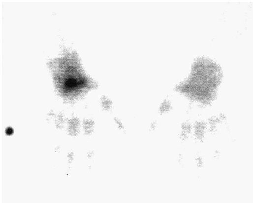
Figure 1. Bone scan showing an increase in uptake at the location of the capitate with the intensity of a suspected fracture.

edema in the bone marrow of the capitate and dorsal to the bone and a fracture in the capitate bone that divided the bone into a ventral and a dorsal portion, but no dislocation of the fracture (Figure 2). The patient was given a splint. On a follow-up with computed tomography (CT) of the right wrist and plain radiographs in March 2000 (Figure 3), he had slight sclerosis in the middle of