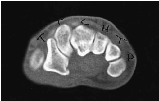
Figure 3. An axial CT scan confirms that the capitatum fracture has healed with no dislocation. A linear band of sclerosis is seen in the capitatum bone (c = capitatum bone).

the capitatum (plain radiograph), but both investigations showed that the fracture had healed without dislocation. The cartilage in the right wrist had a normal appearance. At a second follow-up in May 2000, the patient had normal motion, good grip strength and no pain.