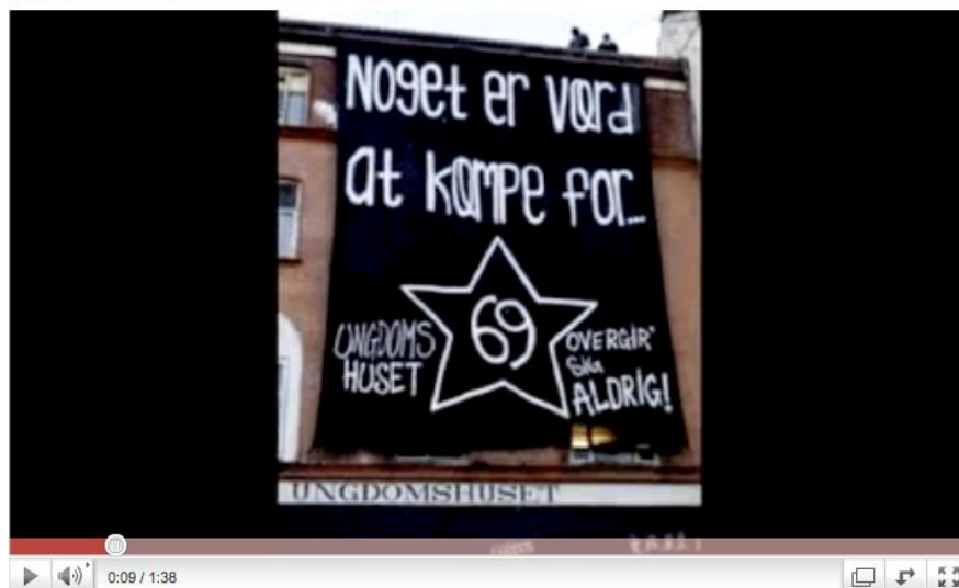
Fig 1. Opening image from the video 'Ungeren Blir': The text reads "Some things are worth fighting for. The Youth House '69' We will never surrender."

However, the myriad voices on YouTube are not in unison as these videos paying homage to the movement are juxtaposed on the very same platform with videos condemning the activists and their cause. The video 'Nej til Ungdomshuset' (No Youth House), draws upon the same kind of imagery as the videos supporting the event. The music used is from a German Neo-Nazi hard rock group vowing to fight for the Fatherland against intruders, and it is difficult to know whether the intent of the sender is to picture the movement as fascist in a pejorative way or if the sender is him- or herself a fascist. This kind of dissonance where seemingly conflictual material appears side by side and is specifically characteristic of YouTube demonstrating the multifaceted nature of such sites, a polyphony of mainstream, alternative, hegemonic and potentially subversive clips (Christensen, 2008: 156).