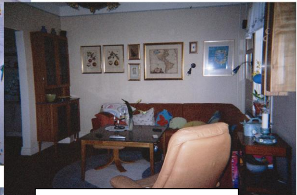
Our home is smaller, messier, more colourful and mixed-up and not as well thought-out and uniform as many of the cold, impersonal, boring and arranged interiors in the collages!