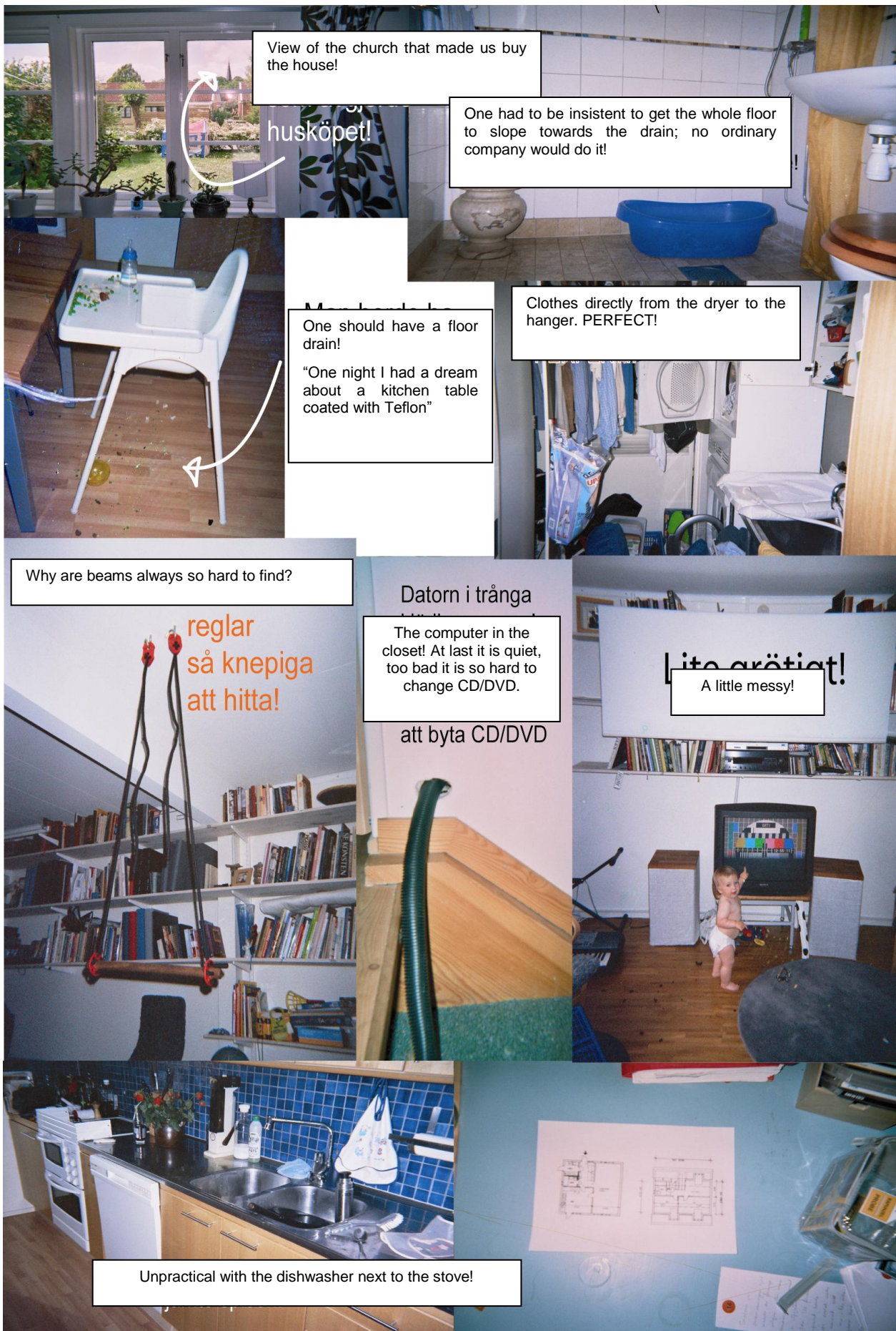
Figure 4: The pilot study collage