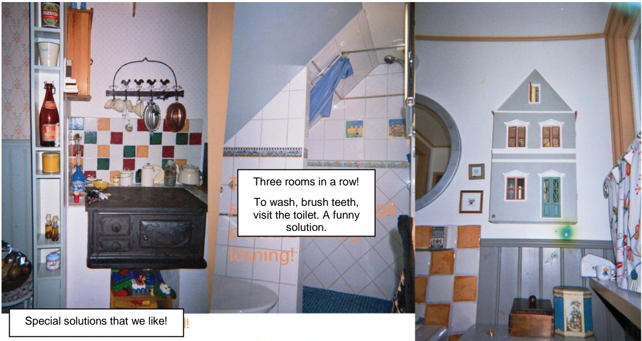
Special solutions that we like!

Three rooms in a row! To wash, brush teeth, visit the toilet. A funny solution.