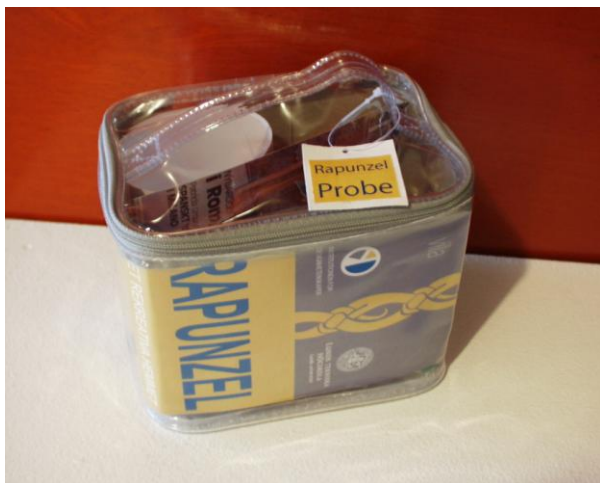
Figure 2: The exterior of the probe

The pilot probe was considered as a sort of antenna for testing the potential of the probe material; how it was to be perceived and above all how it was going to work as a whole. This opportunity to test and check the probe was important. The probe had to be easy to handle even from a cognitive point of view and thereby also easy to properly understand (see Figure 2).