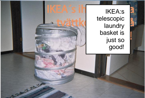
Figure 8: Collage 4a