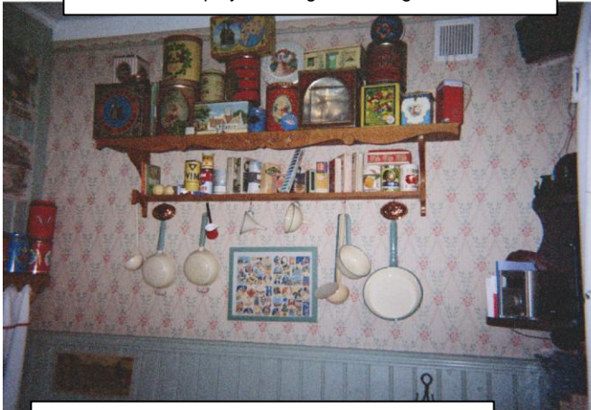
"The collecting shelf". We just like to look at it!