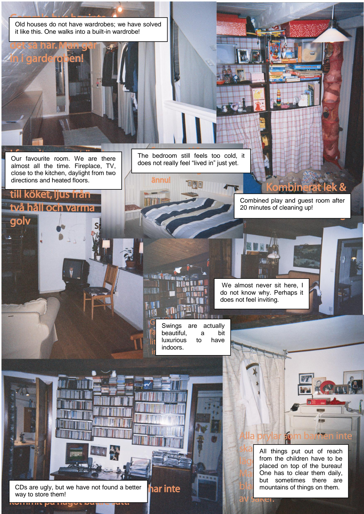
Figure 6: Collage 2a