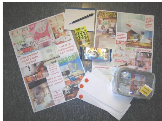
Figure 3: The original probe content

The probe also contained a 27 shot disposable camera, a pencil and 27 numbered pieces of paper (one per picture). The use of disposal cameras and note taking materials are well tested. All