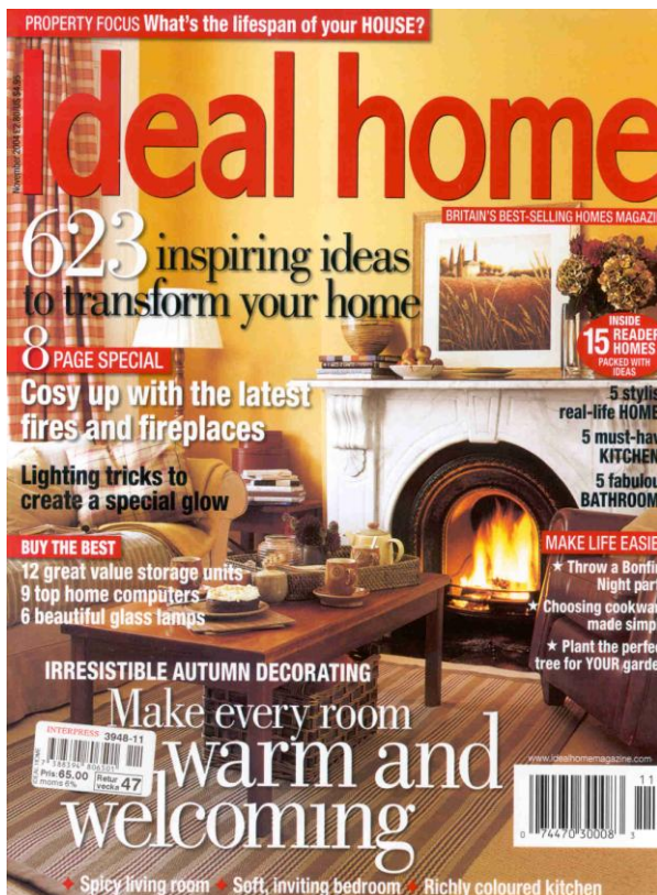
Figure 1: An interior magazine front page

There is an interaction that allows subjective discoveries and interpretations [3]. Probes have, however, proven themselves to be well equipped to meet methodological obstacles that arise in different home environment settings [1]. The interpretations presented in this case study, as in all studies, are not free but focused and carefully selected. How can a probe be designed and developed to maximize the benefits and use for both probe user and researcher? In this case study the researcher wants material for inspiration and information from members of a pre-selected group: ten parents with small children. The probe users' compensation is hopefully stimulating intellectual tasks, new perspectives on their living, or even increased well-being.