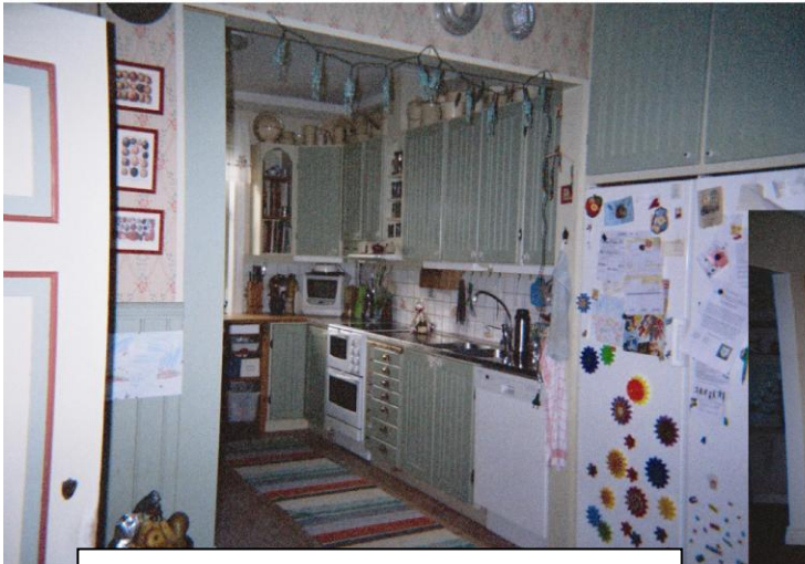
Most delighted about the kitchen! Plenty of room for play, cooking and eating.

Three rooms in a row! To wash, brush teeth, visit the toilet. A funny solution.