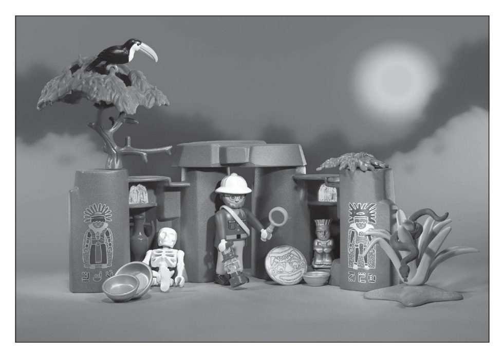
Fig. 3. Hairy-chinned Playmobil explorer searching for clues in order to illuminate ancient civilizations in the jungle. Image by courtesy of Playmobil, a registered trademark of geobra Brandstätter GmbH & Co. KG, reproduced by permission. The company also holds all rights to the displayed toy figures.

of archaeology that seems to have been overlooked at times by the archaeologists themselves.