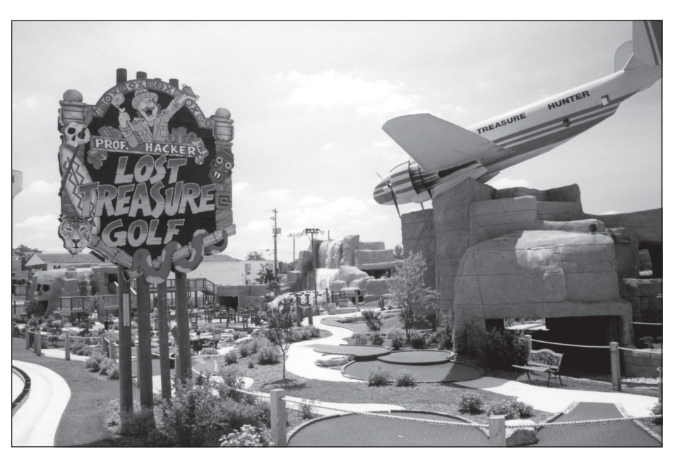
Fig. 1. Lost Treasure Golf with Professor Hacker leading an expedition to search for ancient gold and diamonds. Seen in Branson, Missouri. See also http://www.losttreasuregolf.com/.

Entering the underground can be an adventurous and sometimes dangerous