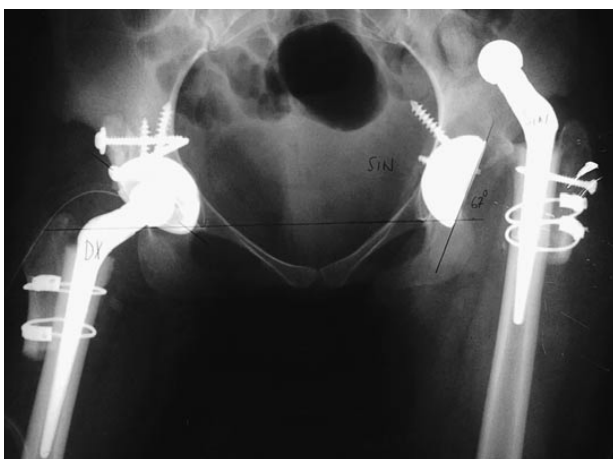
b. 4 months after surgery on her left hip and immediately after surgery on her right hip.