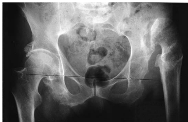
a. Before and