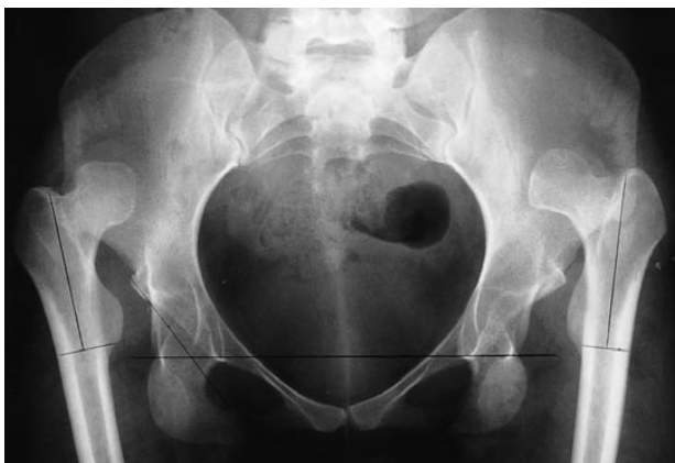
a. 25-year-old woman with bilateral dislocation due to CDH.