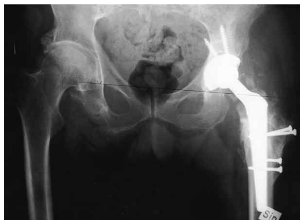
b. 34 months after surgery

age-matched data for a normal population (Ringsberg et al. 1998). The evaluation of walking speed was done only at follow-up. Case 8 was excluded because of neurological disease not related to the hip surgery. Case 2 was excluded from this part of the study because she developed arthrosis in the contralateral hip