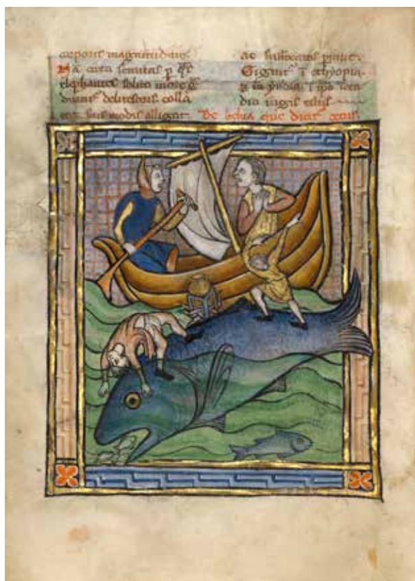
Two Fishermen on a Sea Creature, about 1270. Unknown illuminator. The J. Paul Getty Museum, Los Angeles.

Something similar, but with more obviously problematic results, from an ideological point of view, occurs in Casper Henderson's remarkable recent volume, A Book of Barely Imagined Beings (2012). Henderson deploys the bestiary genre both more overtly – the book's subtitle is A 21 st Century Bestiary – and more experimentally. He uses both science and imagination to describe some of the “many real animals [that] are stranger than imaginary ones”, drawing attention to the way in which “our knowledge and understanding ... are too cramped and fragmentary