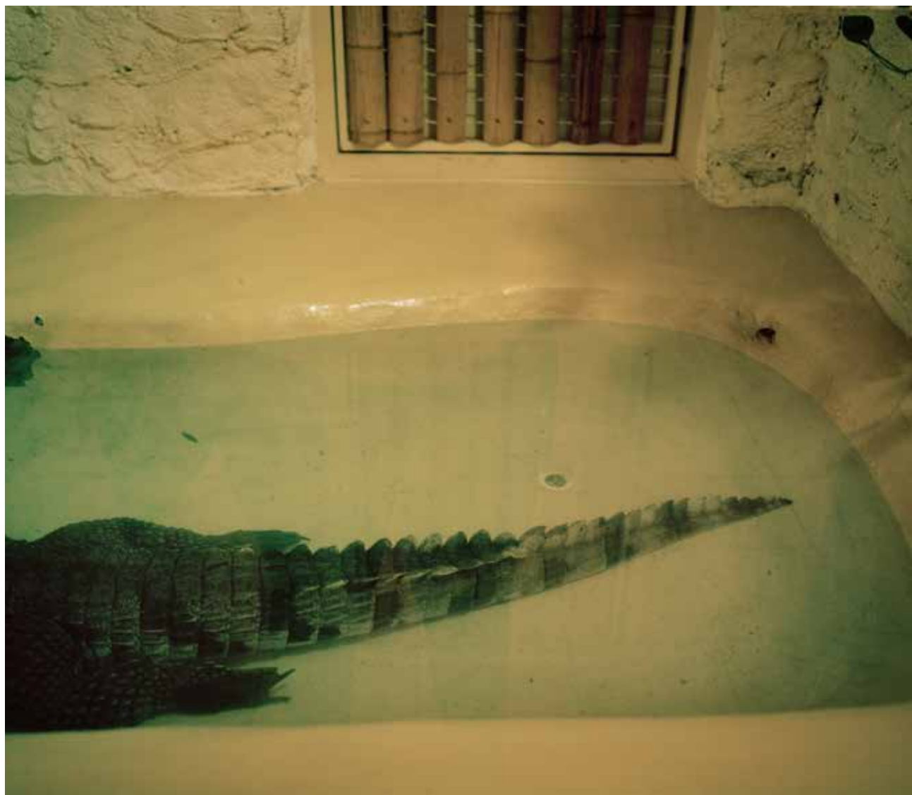
Crocodile, Gdansk Zoo, Poland.