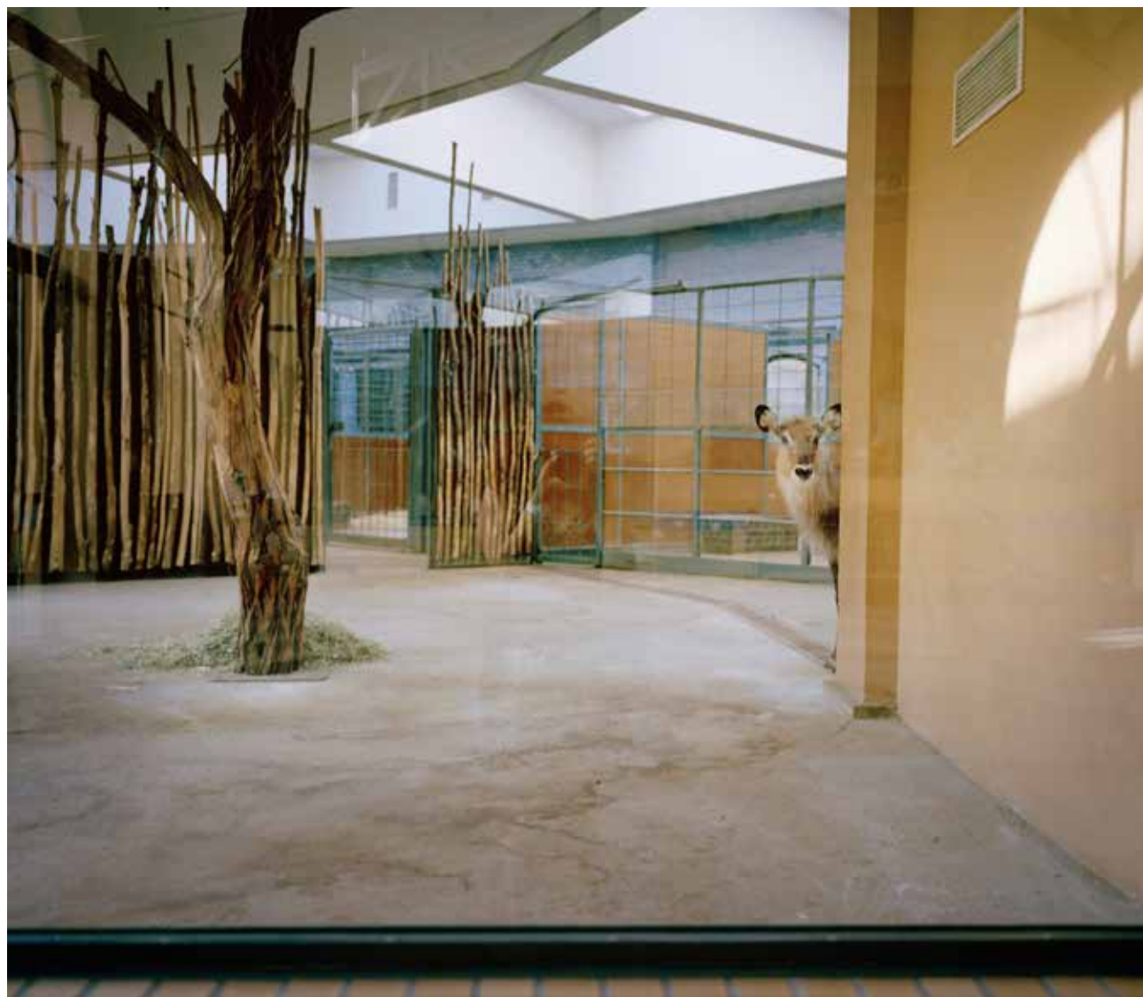
Waterbuck, Berlin Zoo, Germany.