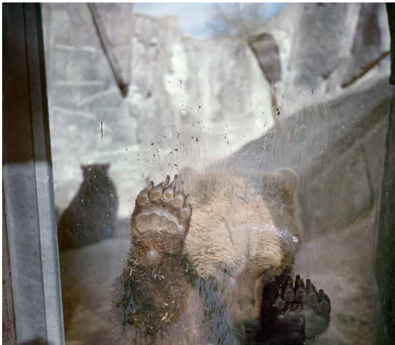
Brown bear, Skansen Zoo, Sweden.