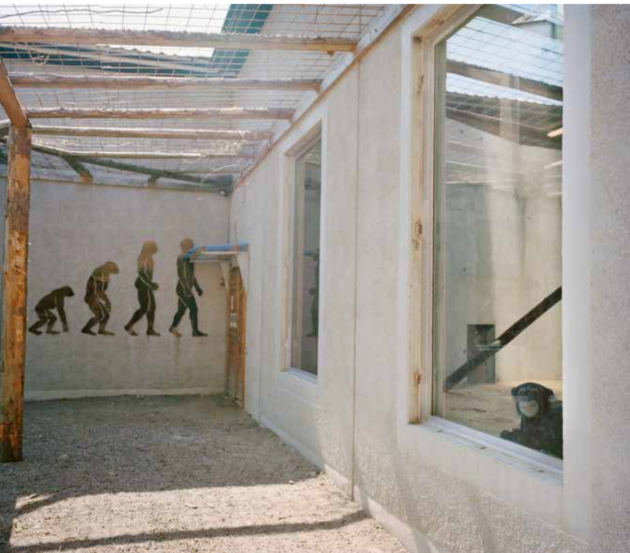
Chimpanzee, Ölands Zoo, Sweden.