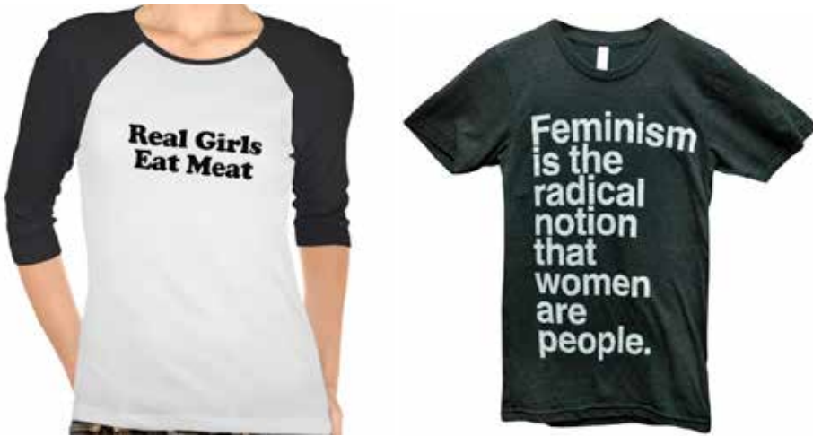
T-shirts available on the web

time, but it doesn't really matter; what does matter is that the pronouncement is far from being 'radical,' on the contrary, it also supports a kind of identity and dubious feminism expressed on t-shirts: "Real women eat meat." Which finally leads me to the question I ask in the subtitle of this essay, "Is Animal to Human as Female Is to Male?", which is a take on Sherry Ortner's essay "Is Female to Male as Nature Is to Culture?" (Ortner, 1974).