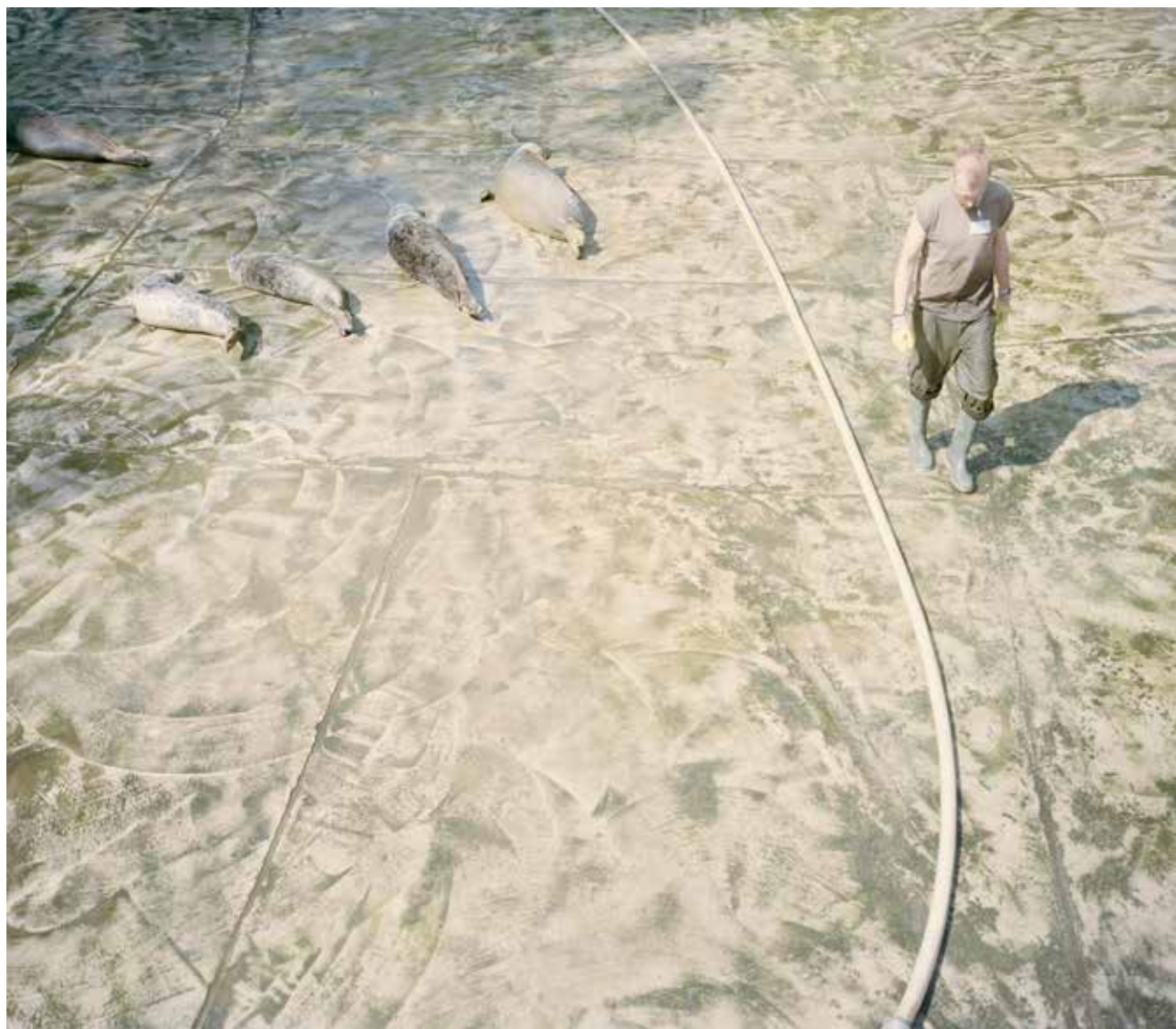
Grey seals, Gdansk Zoo, Poland.