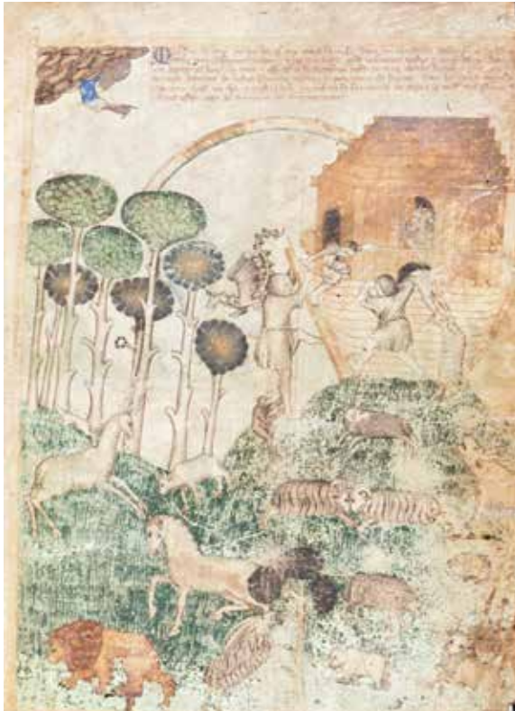
Miniature of the debarkation from the ark, and the rainbow. From the Egerton Genesis Picture Book, 14th century. Attributed to the Egerton Master. British Library.