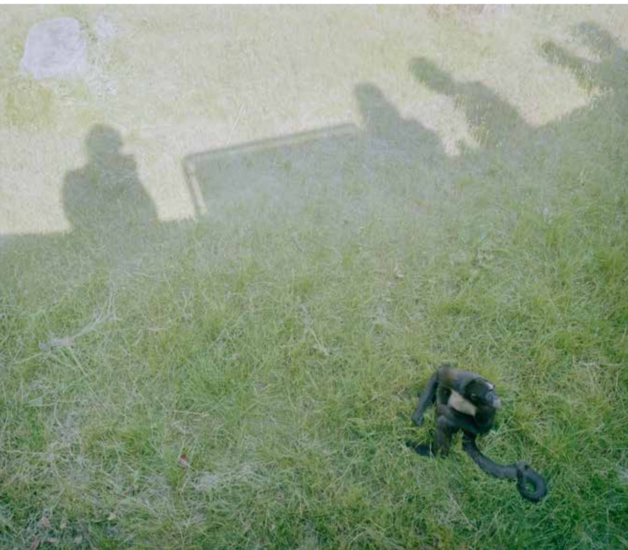
Spidermonkey, Copenhagen Zoo, Denmark.