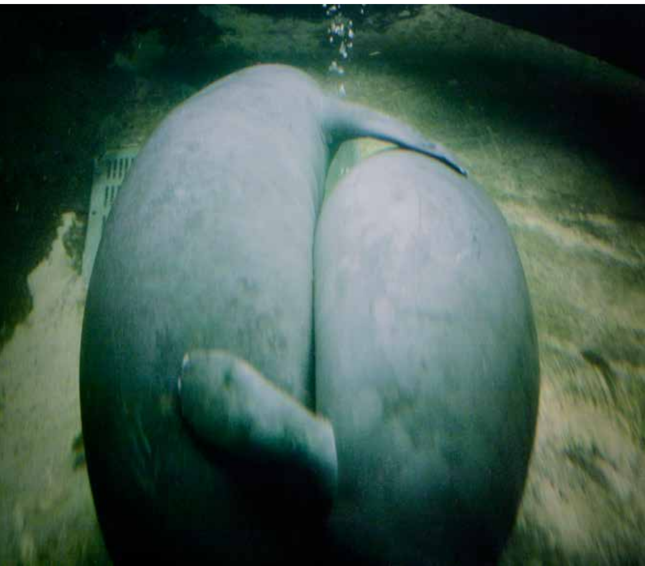
Manatees, Odense Zoo, Denmark