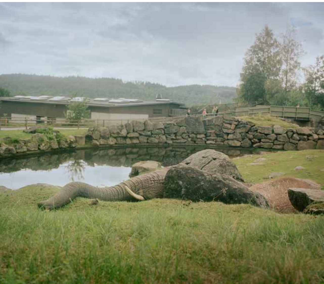
Elephant, Borås Zoo, Sweden.