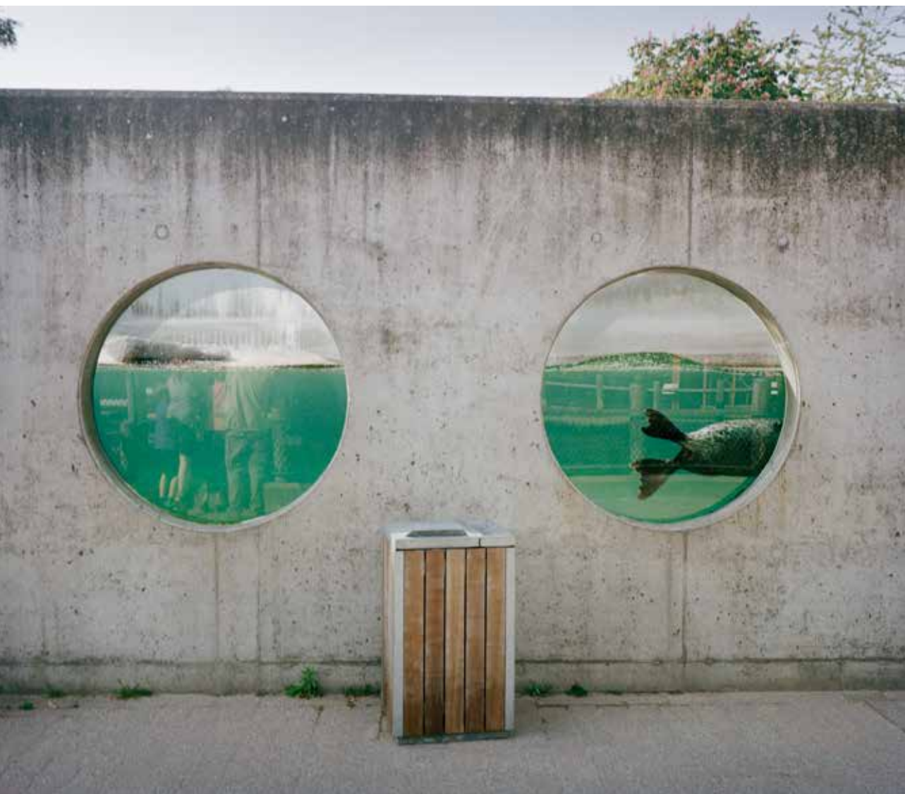
Harbour Seal, Odense Zoo, Denmark.