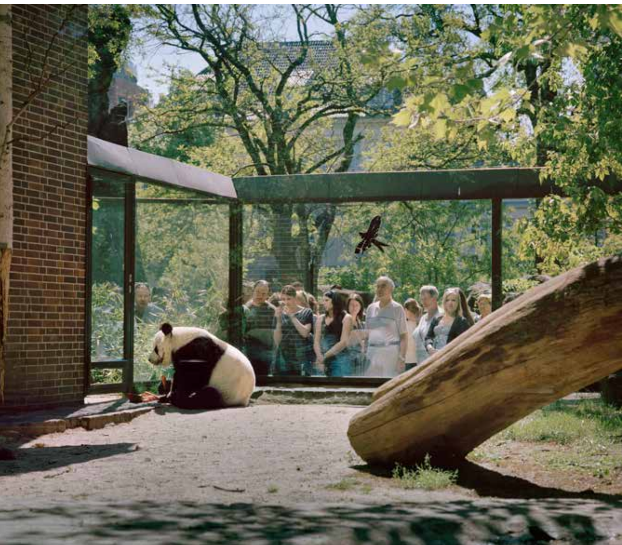
Giant Panda, Berlin Zoo, Germany.