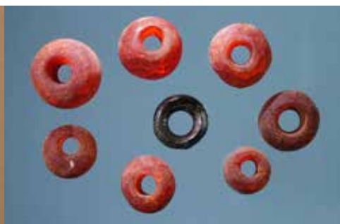
Figure 3. Seven amber beads and one bronze bead, Agerbygaard, Bornholm.