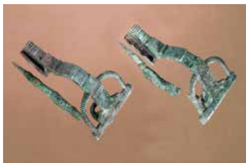
Figure 2. Fibulae, Agerbygaard, Bornholm. Length approx. 50 mm.