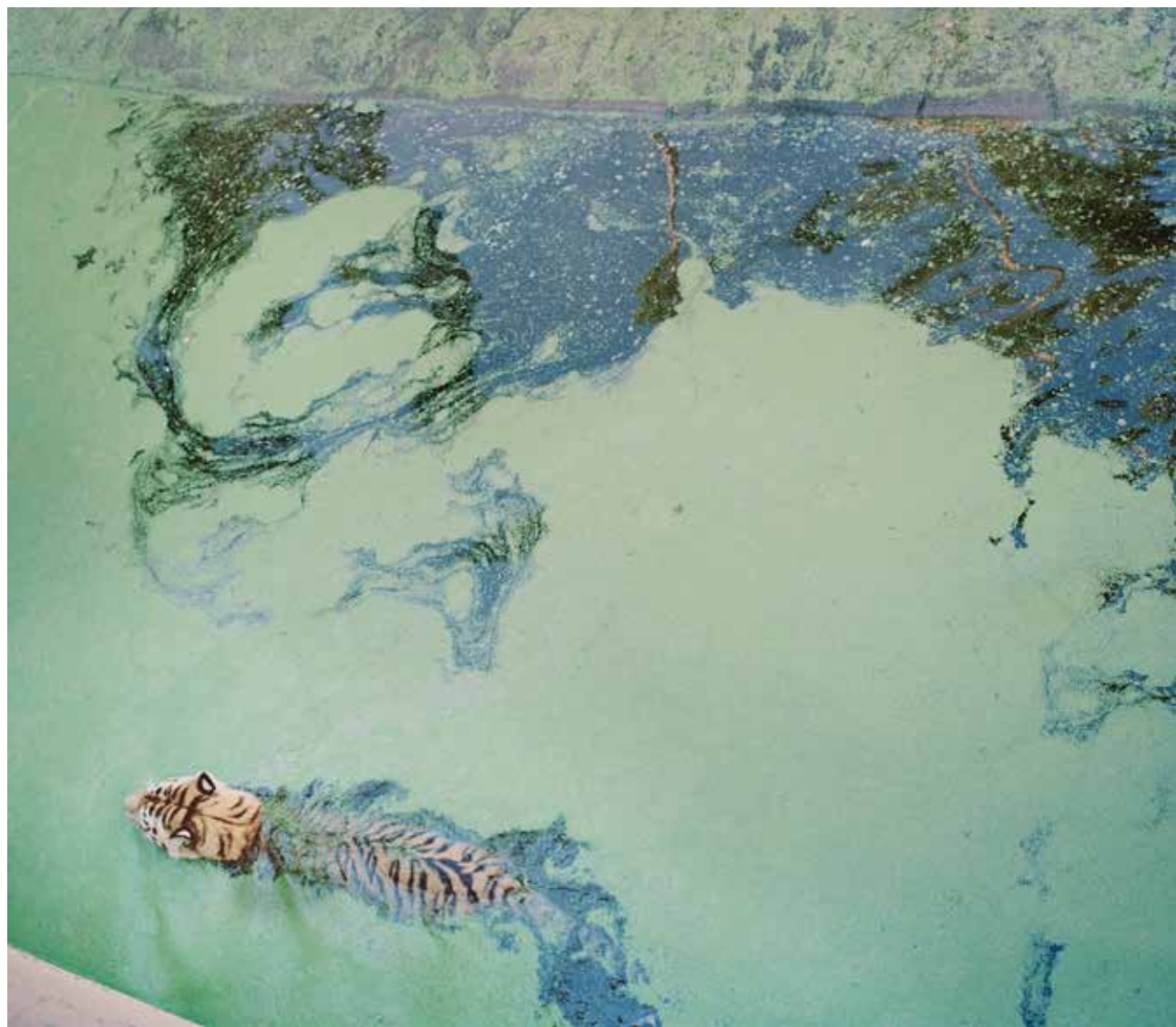
Tiger, Kolmården Zoo, Sweden.