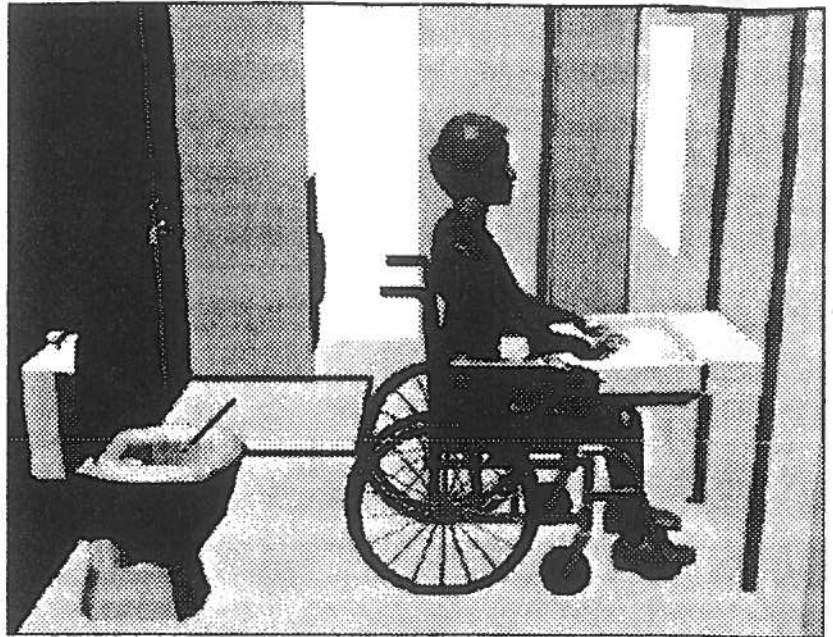
Figure 1. A suggestion of a bathroom adaptation (from case study no. 6).