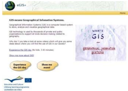
FIGURE 2 THE CLOUD, INTRODUCTION WHAT IS GIS? [3-5].

As can be seen in the portal, there are options for simple explanations of GIS, e.g. from YouTube or, if the interest increases (e.g. videos from Lund University) that explains in more detail about GIS, (Figure 2, 3). This corresponds to personalization [8, 11, 18, 19] and Laurillard concepts [18], using different approaches depending on learning styles for individuals. Additional links in the cloud “What is GIS?” are to be found as below [3-5].