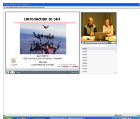
FIGURE 5. FROM THE CLOUD GIS EDUCATION. THE SDI MODULE, 3ECTS [3-5].

In addition one example is from the Education cloud (Figure 5). Courses and education related to GIS are available here. In the eGIS+ Project four courses with credits were developed: GIS Introduction 3 ECTS, Open Source Geospatial 3 ECTS, Introduction to SDI 3 ECTS, and GIS Introduction 10 ECTS. All partner institutions offering GIS courses and a set of video lectures (Figure 6) has been produced within the partnership available through the portal www.e-gis.org .