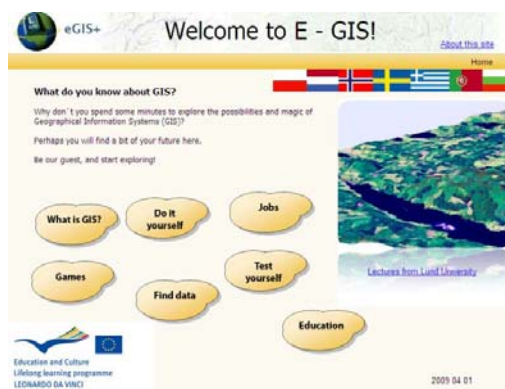
FIGURE 1 OVERVIEW OF THE eGIS+ PORTAL www.e-gis.org

The purpose of using “navigation clouds” is to let users find their own area of interest, and to navigate and “jump” depending on personal or professional interests, needs and curiosity. For example, under the “What is GIS?” cloud, short descriptive videos at different levels depending on the users pre-understanding will be found (Figure 1). In “Do it yourself” there are possibilities and information on what kind of software and web applications can be used, as well as examples on how to make a Google map and different kinds of exercises [3-5].