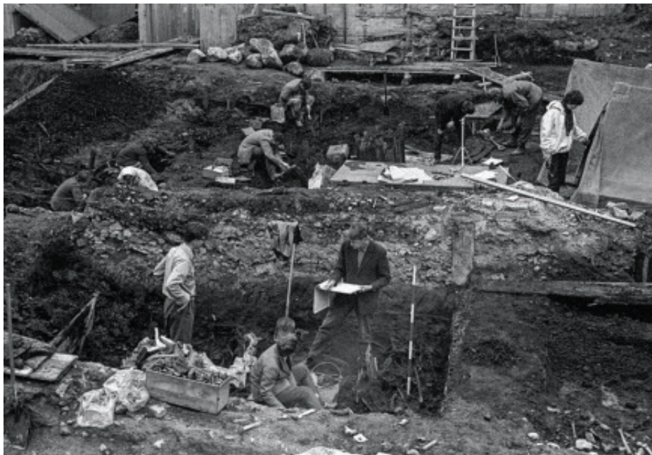
Fig 9.3 The 'Thule Excavation' in Lund, Sweden. Photo: Ragnar Blomqvist, The Museum of Cultural History in Lund , 1961.

There are, however, both professional and personal connections between the two roots of Medieval Archaeology. Thus the city's antiquary at the Museum of Cultural History, who for decades conducted investigations into the cultural layers of medieval Lund, had in his luggage an art-historical dissertation on churches (Blomqvist 1929).