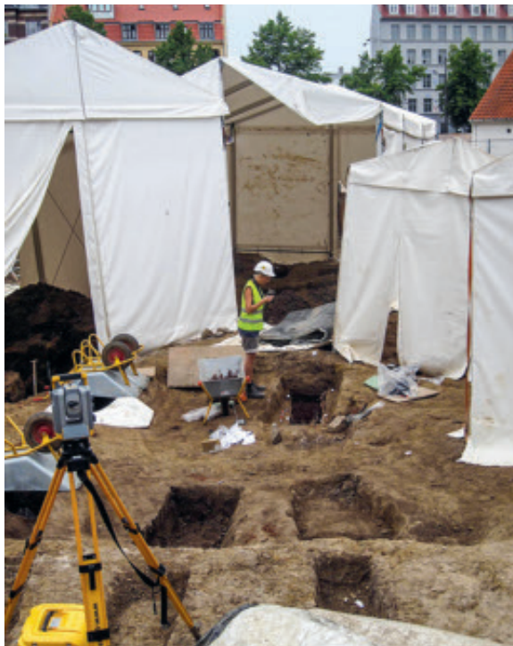
Excavations at Assistens cemetery in Copenhagen, Denmark.