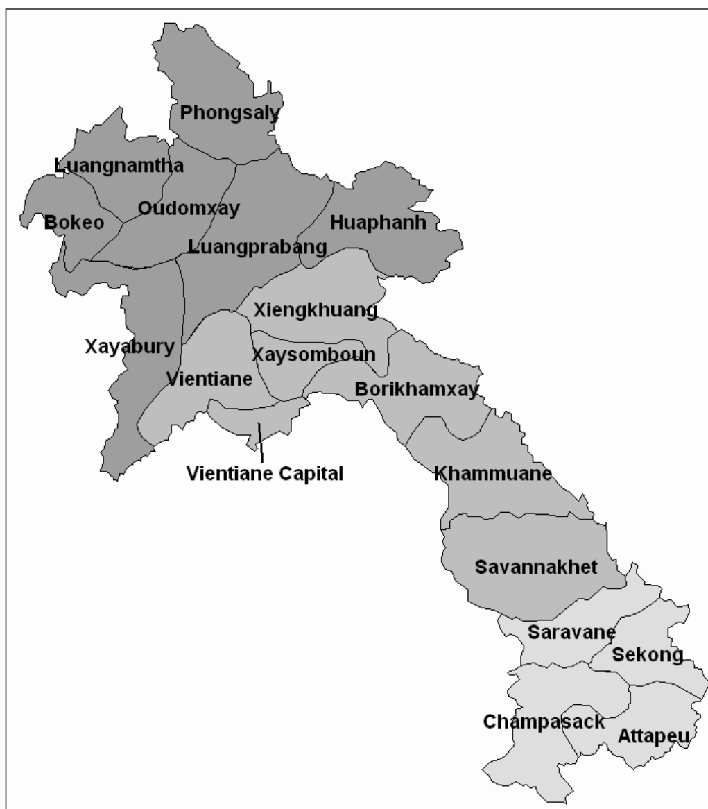
Figure 2: Map of Lao PDR.