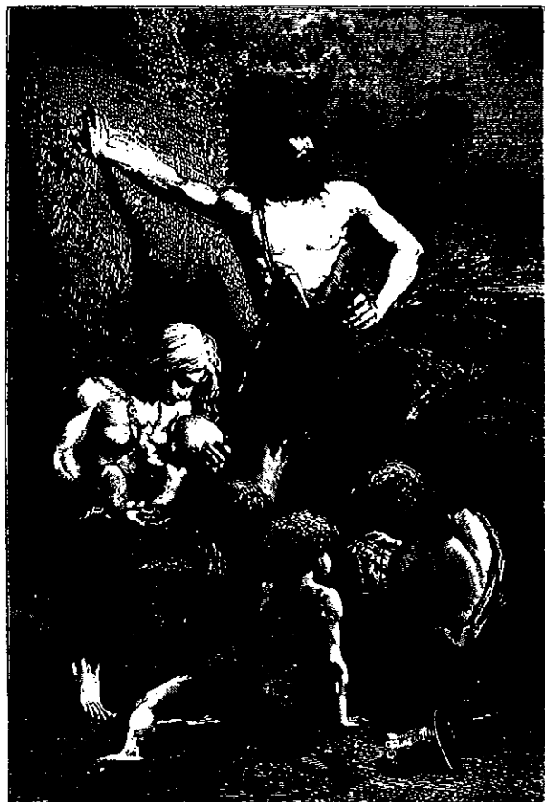
Figure 3.1 Stone age family (Figuier 1870).

of agriculture. Unfortunately, women and men have often been concealed behind concepts like structures , spheres , rich and poor , rulers and the ruled . Women and men, young and old, should therefore be made visible and given a more prominent place in archaeological interpretations.