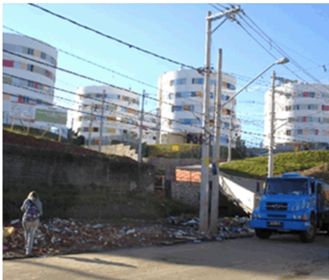
Figure 3: Municipal solid waste (MSW) accumulated on the sidewalks around the SABESP II, residential buildings, designed by architect Ruy Ohtake.