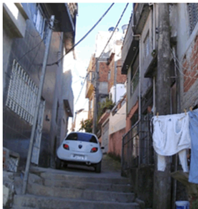
Figure 2: Stairways and alleys of Heliópolis.