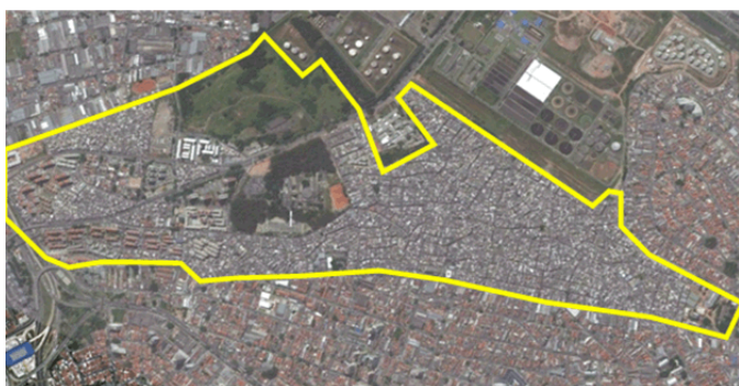
Figure 1: Location of Heliópolis Favela.

The local government should offer tax incentives for recycling industries to expand this market and broaden the system of reverse logistics. Furthermore, to ensure that more recyclables may increasingly be diverted from dumps and landfills, taking another destination and returning to the economic cycle. Public policies need to