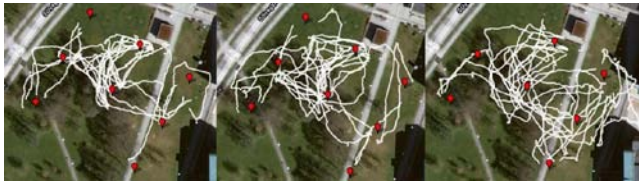
Figure 4. Trails for 90 ° (left), 120 ° (center) and 150 ° (right)