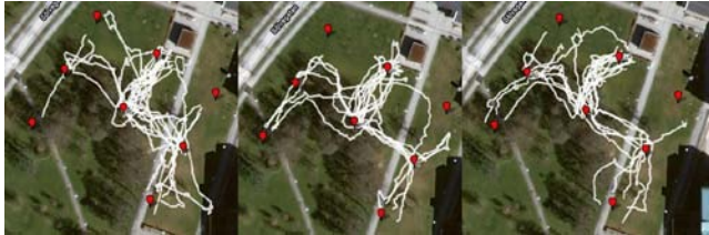
Figure 3. Trails for 10 ° (left), 30 ° (center) and 60 ° (right)

Trails at the main (more realistic) test location can be seen in the following sequence of images.