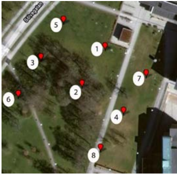
Figure 1. The grid points for the test trails. All trails started at 1. At 2 you could turn either right or left. The same happened at the following point (3 or 4). The four possible goals were located at 5,6,7 and 8. Picture made with GPSVisualizer, http://www.gpsvisualizer.com/ .

To see what happens in a completely open environment we also carried out three tests in an open field further away. The test tracks were based on a grid structure (see figure 1).