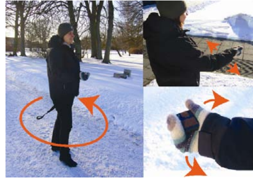
Figure 6. a) Whole body rotation keeping the arm and hand fixed relative to the body, b) arm scan, c) wrist flex

We saw three main types of standing still gestures. The first, which basically all users made use of, was to hold the device out in front of the body, keeping the arm and hand position fixed relative to the body, and walk around on the spot (sometimes in a small circle), see figure 6a. A gesture which was used both while walking and while standing still was the arm scan. In this gesture the arm was moved to the side and back again, see figure 6b. This gesture occurred to one side only or from side to side. The third type was hand movement only – the user moved the hand by flexing the wrist (figure 6c). This gesture was also used both standing still and while walking.