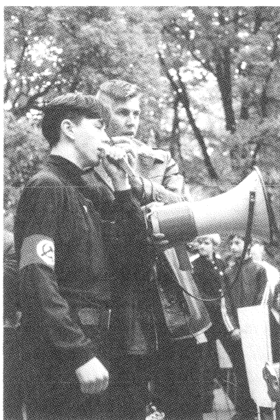
The armband is inspired by the ones that Nazis used to wear, but Russian nationalists have exchanged the swastika for the hammer and the sickle.

1980s and the introduction of Mikhail Gorbachev's glasnost politics, a Russian national identity crisis has given rise to a lot of questions about the national survival of the Russians. These concerns were rooted in the agenda of the Russian nationalists of the Brezhnev era, but became extremely aggravated by the revolutionary societal changes that occurred in the years around 1990. Gorbachev's reform politics and explicit ambitions to make the Soviet Union a part of a "common European house," but also the growing economic and political crisis, the dramatic revelations about