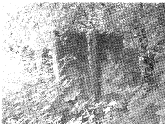
The Jewish cemetery in Szydłowiec.

who grew up in these blocks had no idea that they lived in the centre of the old Jewish neighbourhood. 12