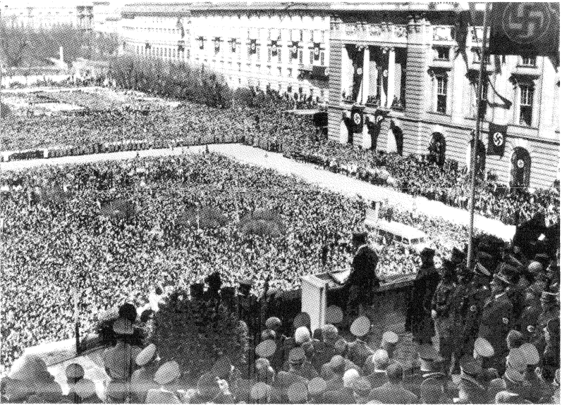
Anschluss 1938. Hitler holds his historical speech at the Heldenplatz in Vienna on March 15, 1938.

ly, that there is a long-standing ambivalence in the Austrian national identity between an Austrianist view of this identity and a Germanist view; secondly, that the Austrianist view, the one dominant after 1945, uses Germany as the main and firmly established counter-image. The main characteristic of the Austrian national identity project after 1945 is the consequent use of Germany as the identity-generating counter-image. The line of development drawn in the historical narrative of Austrian nationhood was a Sonderentwicklung vis-à-vis Germany, which was sometimes traced back to the Middle Ages. However, this perceived opposition to Germany was not only a construction of the time after 1945; it can be traced back to the 18 th century conflicts between Austria and Prussia, through the conflicts of the 19 th century which culminated in the war of 1866, and it became programmatic in the Austrian ideology of the Ständestaat (1934–1938) and its defensive struggle against Nazi Germany – the latter is often termed Staatswiderstand (“state resistance”) against Nazism in the terminology of the Austrian national ideology. The Anschluss to Germany in 1938 was the Great Defeat in this tradition.