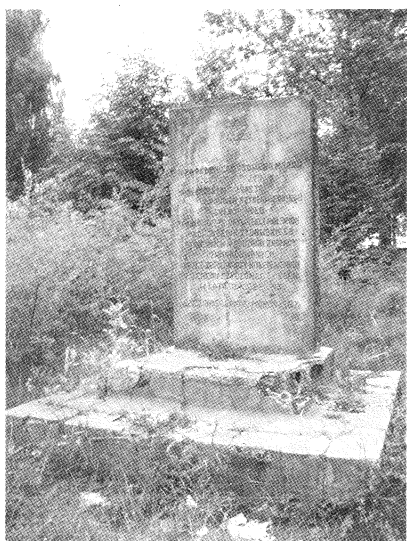
The monument dedicated to the memory of the Jews from Szydłowiec and its surroundings.

as an order from the Communist Party on the district level. The monument was built and unveiled but later quickly forgotten. Until 1974 it was not even mentioned on official lists of monuments and memorials in Szydłowiec. Since the attitude of the Communist Party towards the Jews was hostile after 1968, nobody ever cared for the monument, which started to decay.