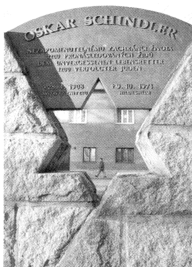
Oskar Schindler's monument in the Czech town Svitavy, with a front section of the house where Schindler was born on April 24, 1908.

everybody will be – just because of Schindler – willing to revise the simplifying indoctrinations brought to us by the Communist regime. 57