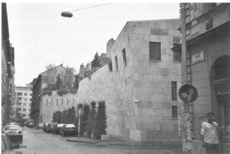
The New Building Complex of the Holocaust Memorial Center in Budapest, which opened in April 2004.

tion: “at the time of its inauguration, in February 2002, in the beginning of the political election campaign, its political allusion to the Hungarian left could not be ignored.” 90