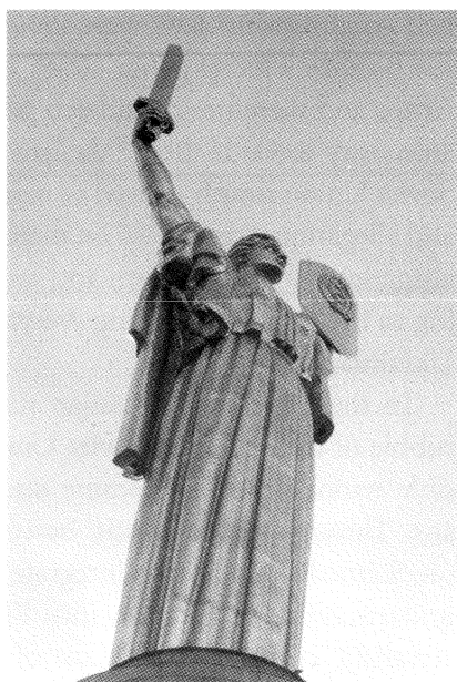
The huge Mat Rodina towering on the banks of the Dnepr River in Kiev, in memory of the Soviet sufferings during The Great Patriotic War.

Expressed somewhat differently, it is possible to discern three different and important factors in Ukrainian historical culture: nationalisation, Europeanisation and a lingering Soviet legacy. These find different expressions in different parts of society and in different historical discourses. Nevertheless, it is possible to identify a certain part of Ukrainian history in which all three are observable, namely in the