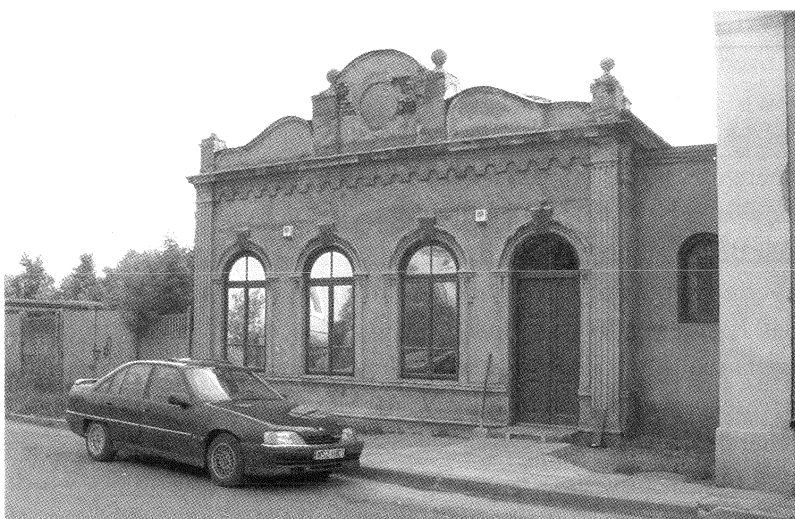
Ejzenberg's synagogue in Szydłowiec, today used as a pub.