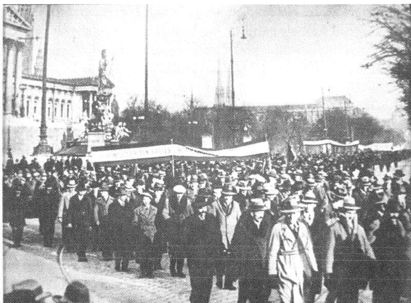
Plebiscite Day, March 10, 1938. Workers demonstrate on the Ringstrasse in front of the Parliament. Banner: 'We want a free, independent Austria.'

also a strong German national tradition. The Austrian German national tradition harks back to the German-Roman Empire and the Great German tradition that expressed itself in the Frankfurt parliament of 1848. The great trauma of this tradition is the war of 1866 and the following exclusion from Germany through the realisation of Bismarck's Little German solution. In the inter-war era the German national tradition was gradually assimilated to Nazism and it viewed the Anschluss of 1938 as the Great Victory and the fulfilment of its aims.