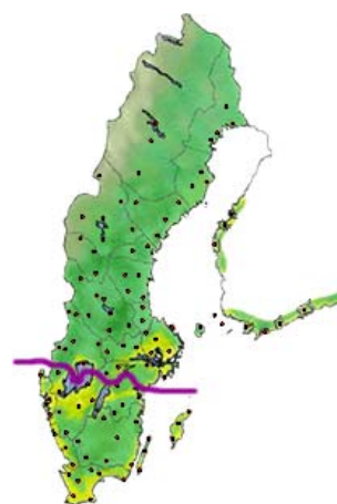
Figure 1: The southern part of Sweden (Götaland = below the line) from where the speakers were selected.