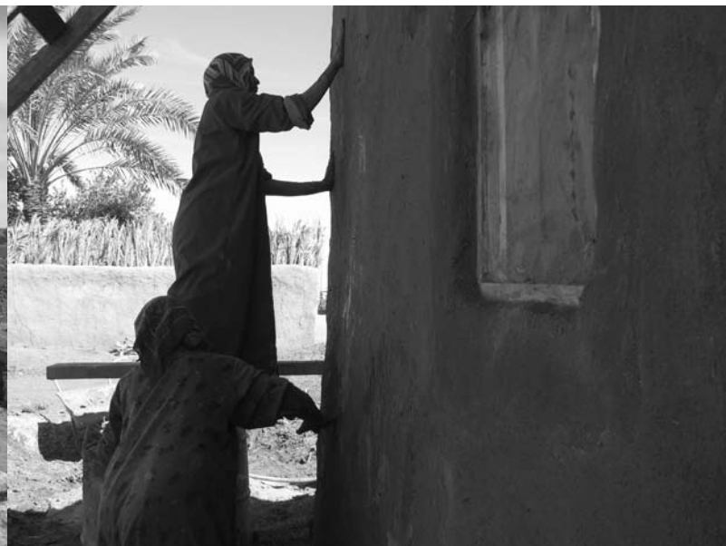
Ladies are always responsible for final mud rendering process for building facades.