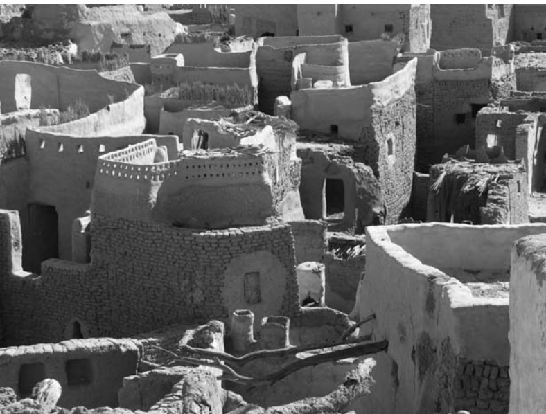
Balat town in Dakhla oasis an example of mud brick town that is still inhabited.