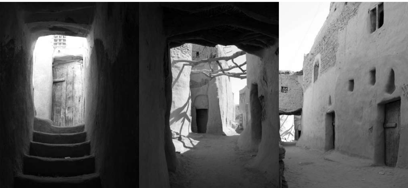
Three photos for desert vernacular towns in the Western Desert of Egypt with shaded streets and alleys. When hot air touches the damp and shaded mud brick walls and surfaces it cools down.

mud easier to tread and to handle when casting. Moreover it strengthens the wall, slows down erosion, helps combat shrinkage and reduces cracking (Wright, 1991, p. 27 & Warren, 1999). Traditionally the proportion of straw in the mud mixture is determined by sight and the feel of the mixture. Dung is also added to this mixture. It was mentioned in the literature that dung acts as a binder and also as an added protection against moisture penetration (Wright, 1991, p. 31). It was also mentioned in Vernacular architecture of West Africa that adding manure and straw to earthen mortar helps microbial products to cement particles of earth and the fermentation of these organic elements reinforces the materials' cohesion (Bourdier & Trinh, 2011, p. 87).