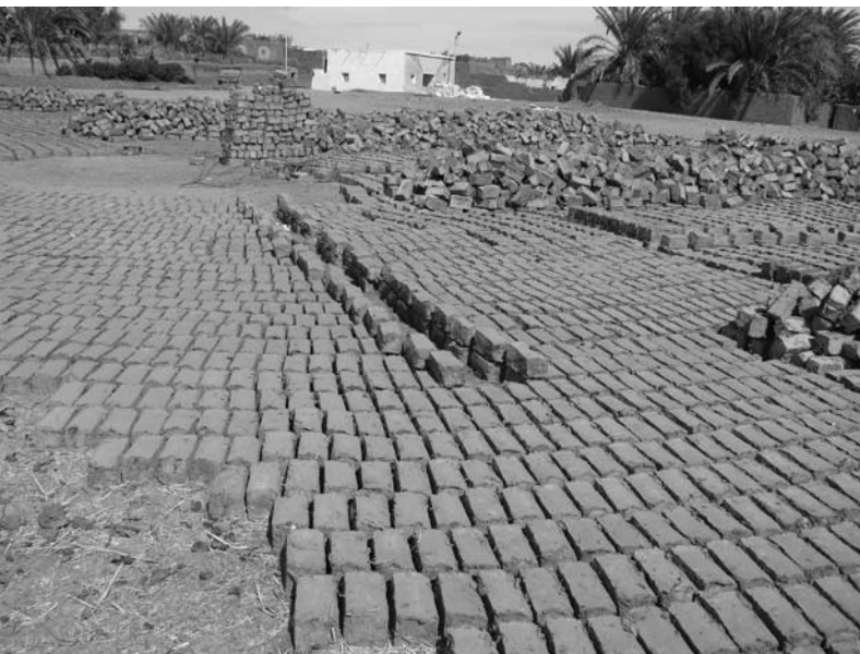
Sun dried casted mud brick is the common building materials in the desert oasis.