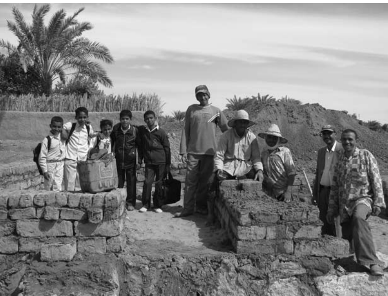
Building process is always a festive event for local inhabitants in the oases.