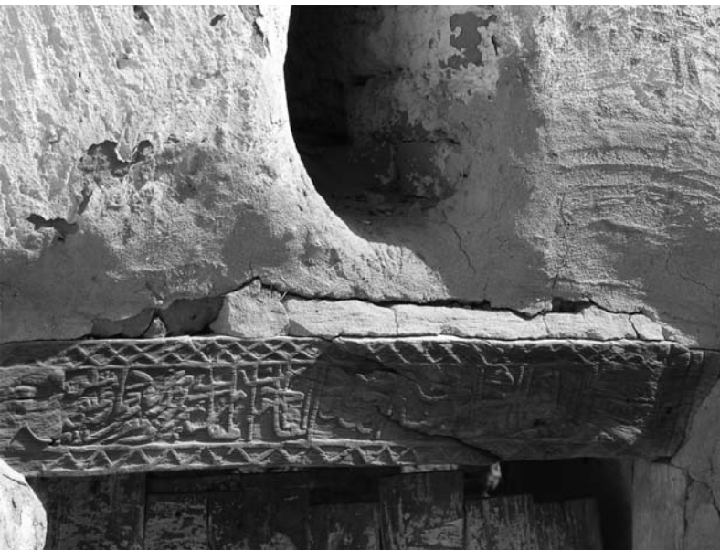
Decorated wood for door lintels in mud brick vernacular houses in the oases.