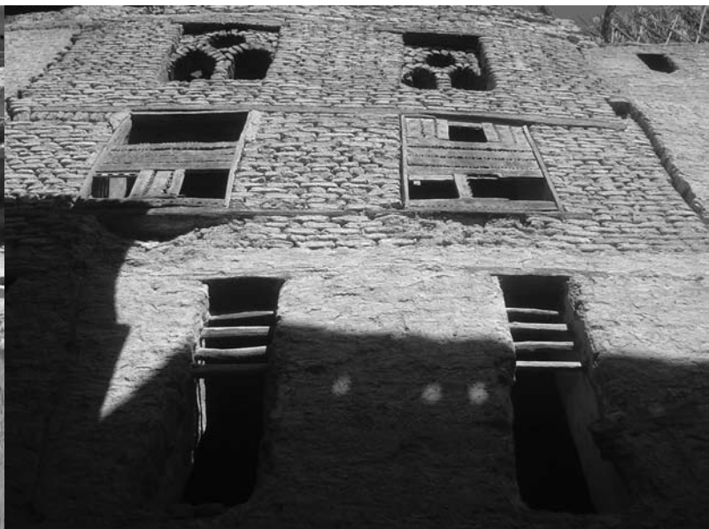
Mud brick vernacular buildings in the oases can be up to four stories high.

fer to an architecture style popular in desert climates in North America (May, 2010). Mud brick (adobe) as a material for building has been claimed to be the oldest and most widely used form of vernacular construction in the world (Wright, 1991). Houses in the desert of Egypt, North Africa and also in the Middle East have been made out of mud bricks for at least 10 000 years (Marchand, 2009). Rael mentioned in his book Earth Architecture that almost half the world's people know how to build dwellings with unfired earth bricks, adobe, rammed earth or stamped earth and have extensive traditions for passing their knowledge on to following generations (Rael, 2009).