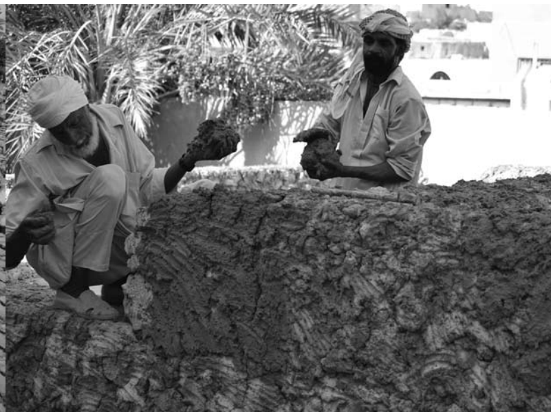
Building process with salt rocks and mud (Karshif blocks) which can be found only in Siwa oasis

craftsmanship, wisdom and accumulation of experience have led to good designs that are comfortable for living and sustainable to this day.