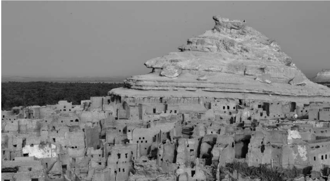
Old Shali, a deserted town in Siwa Oasis in the Western desert of Egypt. An example of vernacular earth towns –built from Karshif blocks- dated back to 13th century.