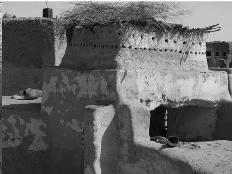
Pigeon towers are built also from mud brick structures in the oases.

particular cultures which employ its countless forms. He emphasizes the necessity of considering this inherited knowledge in relation to the cultural context, as well as in terms of its efficiency or performance, to understand the full implications of the technologies used (Oliver, 2006).