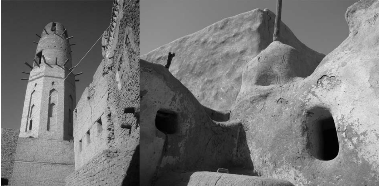
A mosque minaret that reach up to 20 meters high constructed from mud bricks.