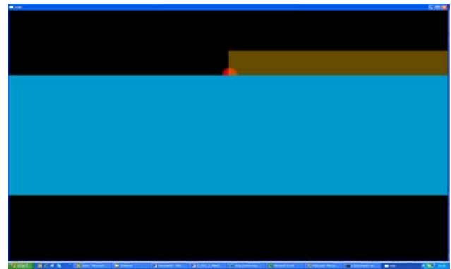
Figure 1. The haptic environment. The red ball followed the PHANToM cursor horizontally in the visual and haptic designs. The yellow transparent area indicate a possibly different area.

Since this was very much a first exploratory pilot, we decided on a very simple setup where the user basically only explored one dimension (along the x axis) and where different combinations of visual, auditory and haptic feedback was given. The visual and haptic feedback was included to get some comparative information with visual pseudo haptics and with real haptic effects. All in all, we explored seven different designs. For each design there was one case where the feedback did not change and one where it changed resulting in a total of 14 designs to be tested. The different feedback designs were presented in random order. For simplicity we only investigated one dimension and we used a PHANToM 1.0 premium for the tests. The use of a PHANToM enabled us to provide real haptic effects, although it was also used as simply a position sensor. The environment is shown in figure 1. The blue block was a virtual slab which provided a surface for the test persons to slide the PHANToM stylus along.