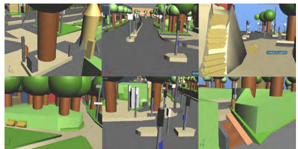
Figure 1. Views from the traffic environment model used.

[3]: moving the world using the arrow keys, moving the world by pushing the sides of the limiting box with the PHANToM stylus and moving the world by clicking & dragging using the PHANToM stylus.