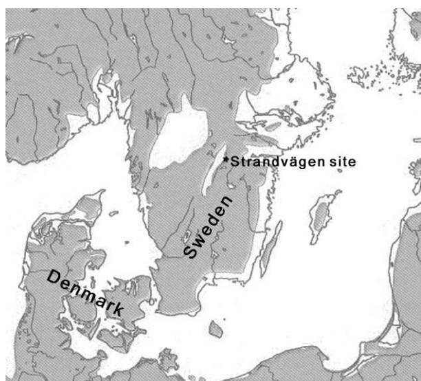
Figure 1 – The location of the Strandvägen site

The site is located on the north-eastern shore of Lake Vättern, the second largest lake in the south of Sweden, at the only outlet of the lake to the Baltic Sea, which at the time of settlement was located about 30 km to the east (fig. 1).