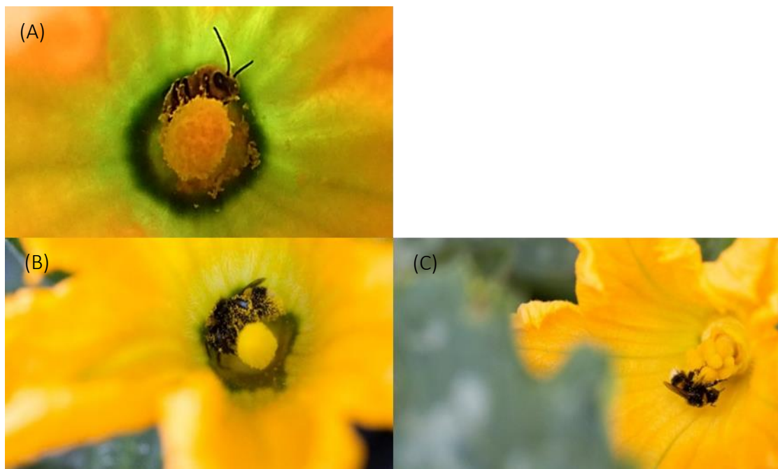
Figure 2(A) Eucera pruinosus visiting a staminate courgette flower for pollen, (B) Bombus terrestris visiting a staminate courgette flower for nectar, and (C) B. terrestris visiting a pistillate Cucurbita pepo flower for nectar. Fig. 2A was taken in California, United States, and Figs. 2B and 2C were taken in the United Kingdom. Fig. 2B and 2C © Daphne Wong.