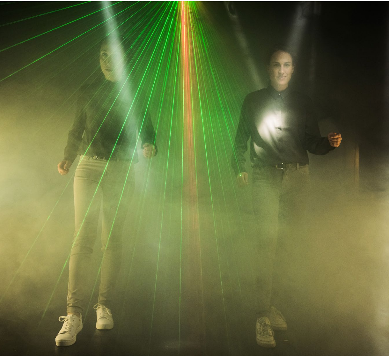
Figure 24 from This is for her , 2017. Performance. © Søren Meisner.

In the final text of the performance I focus on the invisibility of the victim seen from the perspective of a collective “we”. Again I risk using a universalising “we” proposing that it is difficult for “us” who are non-victims and non-refugees to see the victims. My use of invisibility is a clear reference to the novel Invisible Man (1952), by Ralph