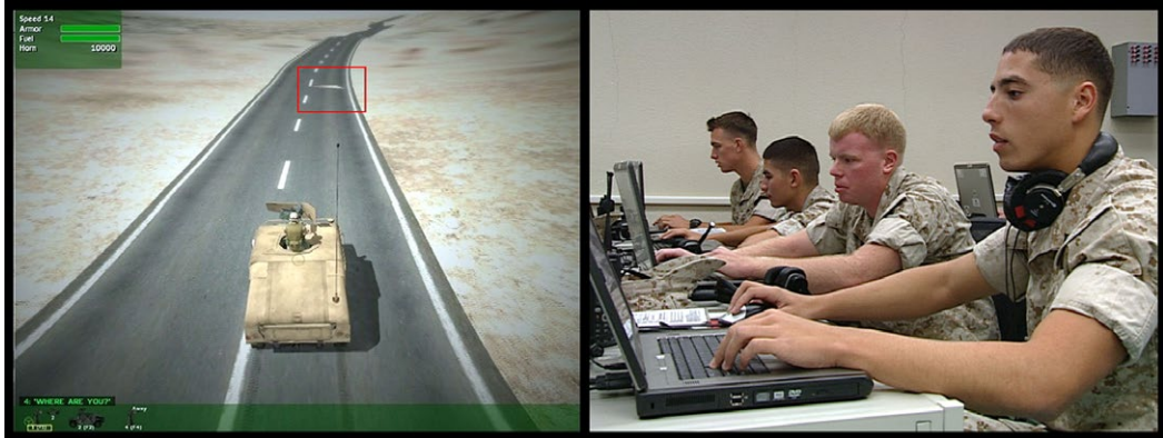
Figure 22 , Harun Farocki, from Serious Games I: Watson is Down , 2010. Video installation. © Harun Farocki.