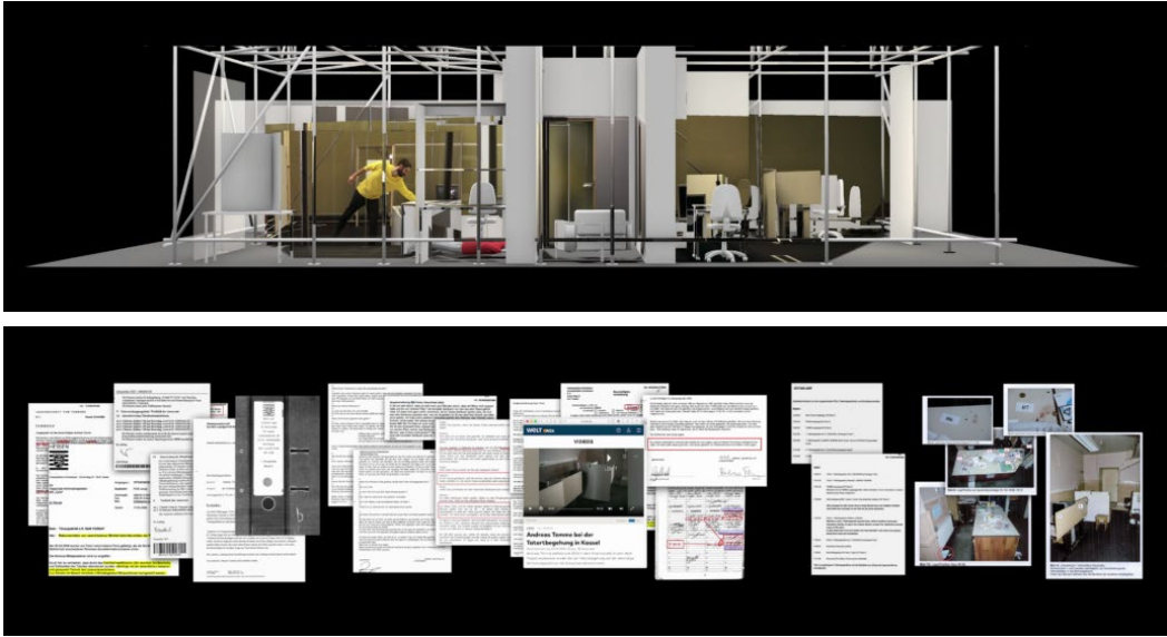
Figure 32 , Forensic Architecture, stills from 77sqm_9:26min , 2017. Video installation.

there is a link. 482 77sqm_9:26min presents a forceful argument, but at times it seems didactic in its formulation of truth, as when the shop is described as “a microcosm for the larger political controversy that ensued”. 483