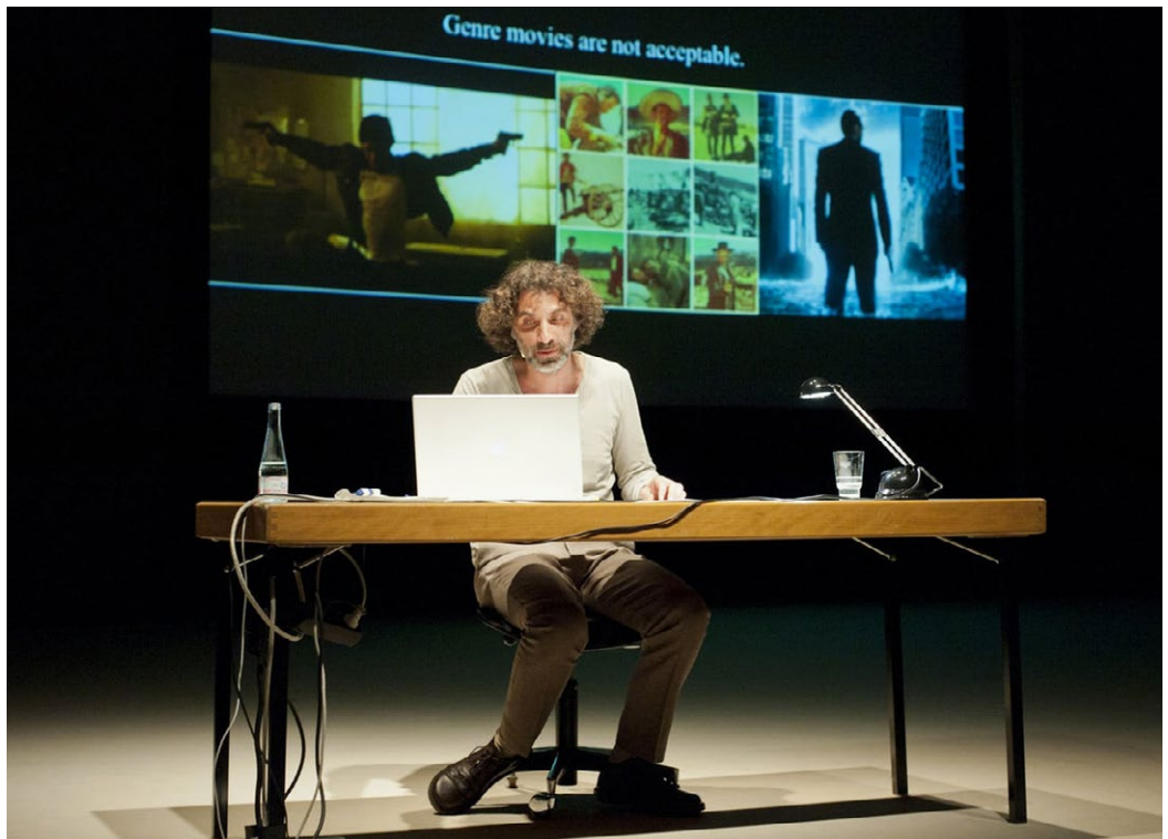
Figure 2 , Rabih Mroué, from Pixelated Revolution , 2012. Non-academic lecture. © Sfeir-Semler Gallery.

Xavier le Roy has been labelled a dancer and molecular biologist, to give him value on the art market. This makes the dilemma of the research-based artist clear. On the one hand, research is presented as a currency, a demand from the art market. On the other hand, it allows the development of an artistic practice where biography can be transformed into theory and the body can be used as a critical tool.