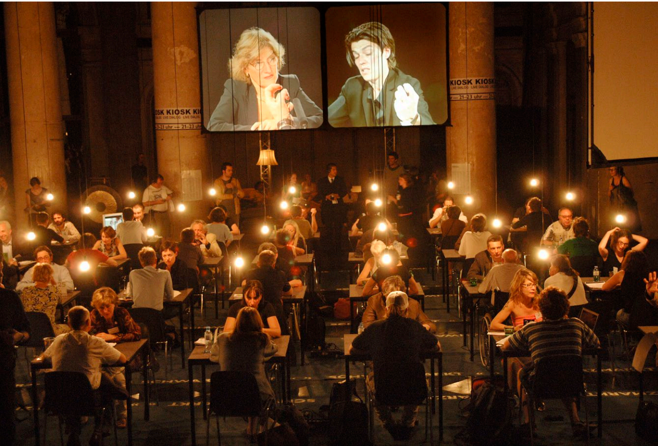
Figure 3, Mobile Academy, from Blackmarket for Useful Knowledge and Non-Knowledge - Nr. 10 "Who will have been to blame", Vienna 2008.