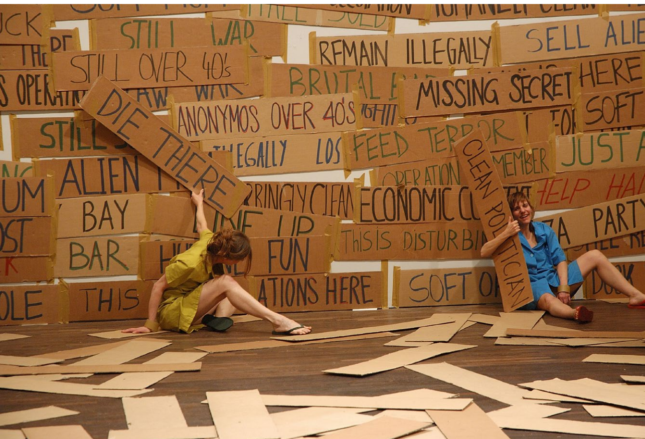
Figure 5, La Ribot, from Laughing Hole , 2006. Performance/ Installation. © La Ribot.

the research in ways that differ from academic, journalistic, or bureaucratic representations of truth. The desire for critical thinking is at the core of the work. Sometimes this means that the contours of the artistic genre are dissolved: we are post-dance (as we saw with the performance installation Laughing Hole or the performance exhibition Expo Zéro ) and post-performance (as we saw with the knowledge exchange performance format Blackmarket for Useful Knowledge and Non-Knowledge ). At other times performances reenact traditional genres in order to point to the arbitrariness of representation (for instance, the musical, crime story, video, and book performance series Life and Times ), or performances set up new genres and frames for experience (as with the documentary performance Situation Rooms , in which the audience is directed by iPad through a big scenography depicting different geographical and historical locations). I have looked at works that are based on research and expose it in the performance situation inviting the audience to think along. These works all have a question to answer, a problem to solve, something to find out. This