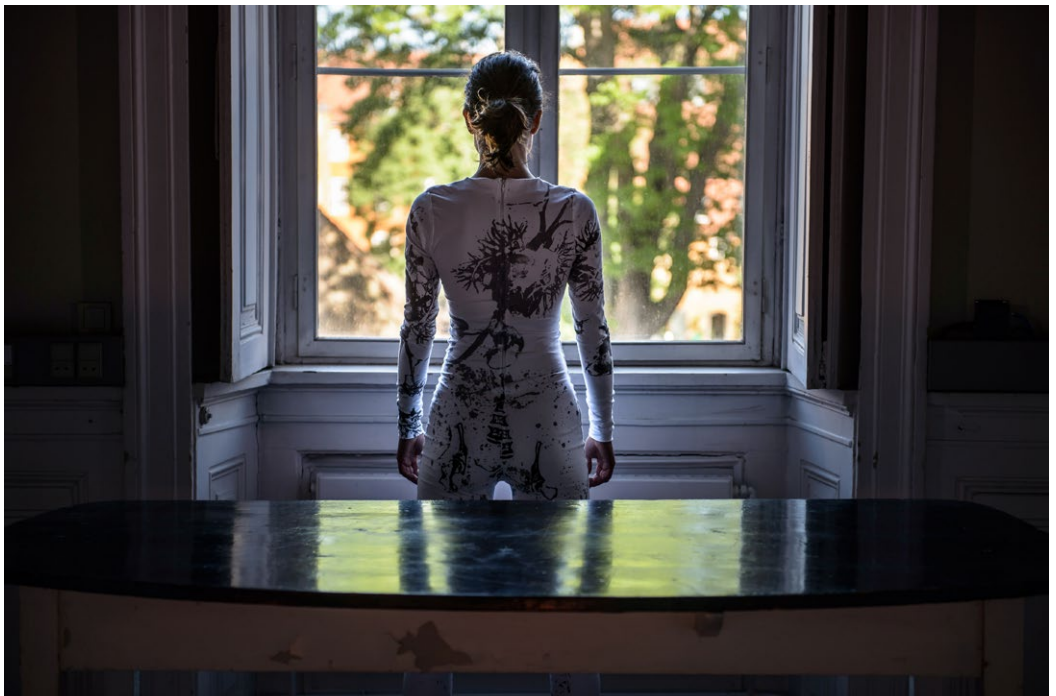
Figure 8 , from Precarious Life , 2014. Performance lecture in Medical Museion.

In what follows here I will investigate the artistic and research-based strategies in Precarious Life . It is a dissection of the levels of knowledge within the performance lecture as well as a study of autoimmunity and terrorism. The study should not be read as a doubling up of the artistic process, but rather as a slow unravelling of the conflict between art and research: does research-based performance generate knowledge, art, or both? My strategy in the performance lecture is to postulate a series of truths in order to create a space for thinking. At the same time, I challenge the authenticity we associate with knowledge: will the audience find me just as credible as a researcher? Does the audience believe in the autobiographical aspects, which serve to generate authenticity? What levels of knowledge are communicated to the audience?