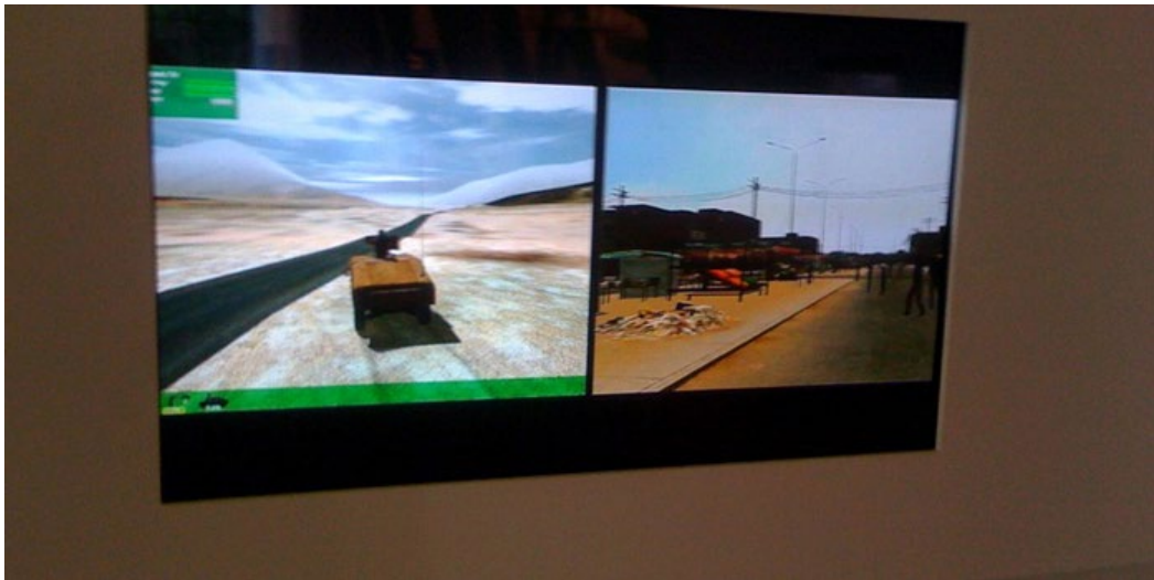
Figure 23 , Harun Farocki, from Serious Games IV: A Sun without Shadow , 2010. Video installation. © Harun Farocki.