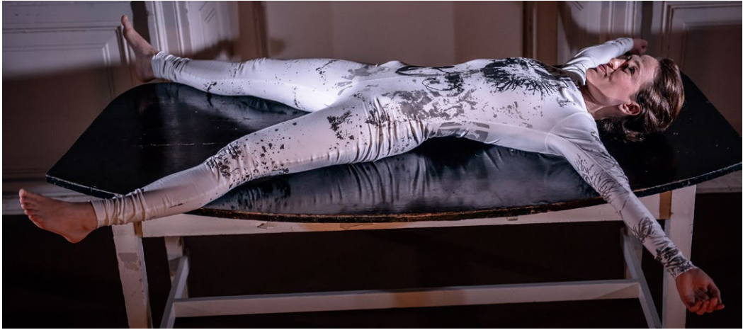
Figure 13 , from Precarious Life , 2014. Performance lecture in Medical Museion.

dancer is “not himself” but also “not not himself”. The same applies to the performance artist who is “not not herself”: she performs somebody else but does not cease to be herself. More “selves” coexist in an unresolved dialectical tension. The actor performing in classical drama differs from the performance artist exactly because she is “not herself”. In Precarious Life I perform a fictionalised version of myself and I am myself on stage as performance artist (“not not me”).