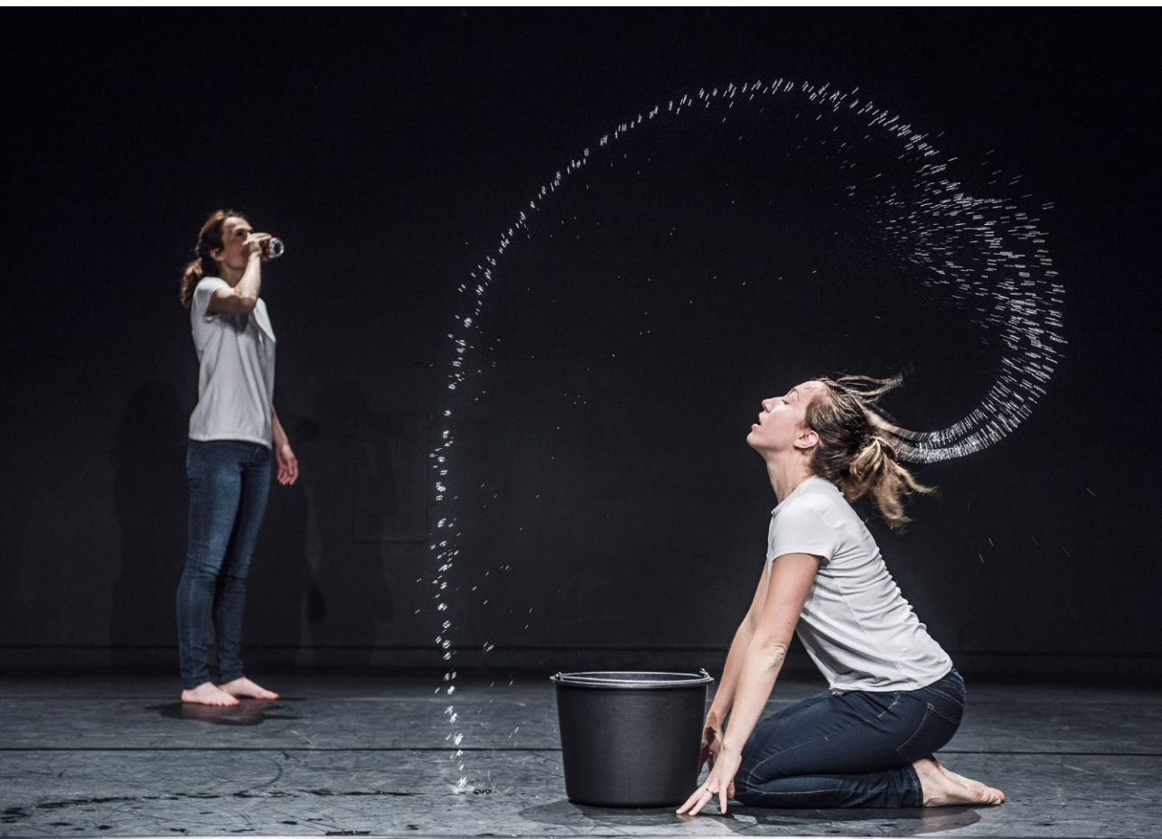
Figure 18 , from I Love You You Love Me , 2015. Staged reading.

The reading had a fragmented structure, which matched the intangibility of the material, but it also mirrored the explorative character of the work process. After the reading, I began to make choices. I wanted to make more interviews with victims in order to expand the testimony of a victim on stage. I wanted to know more about Lynndie England, the female prison guard in the Abu Ghraib prison. And I wanted to examine Denmark’s role as the ones participating in conflicts far away and as the ones offering therapy at home. I imagined a three-part structure for a performance with the title This is for her .