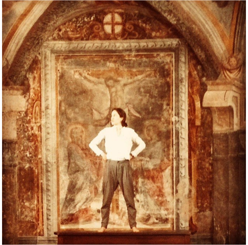
Figure 12 , from Precarious Life , 2014. Performance lecture in Salone Dugentesco, Vercelli, Italy.

Why is it important for the subject to hold such a strong position in Precarious Life , and would the performance be more powerful if the audience had more space to move, act, and think? To answer this question it is important to introduce the distinction between different subject positions within performance. The relationship between the sender and the performing subject is ambiguous, and becomes increasingly complicated as the lines between reference and fiction begin to blur. 178 This is partly due to the complex position of the performer as being herself and not herself all at once, a concept professor of performance studies Richard Schechner defined with the concepts “not me” and “not not me”. 179 According to Schechner, the ritual deer