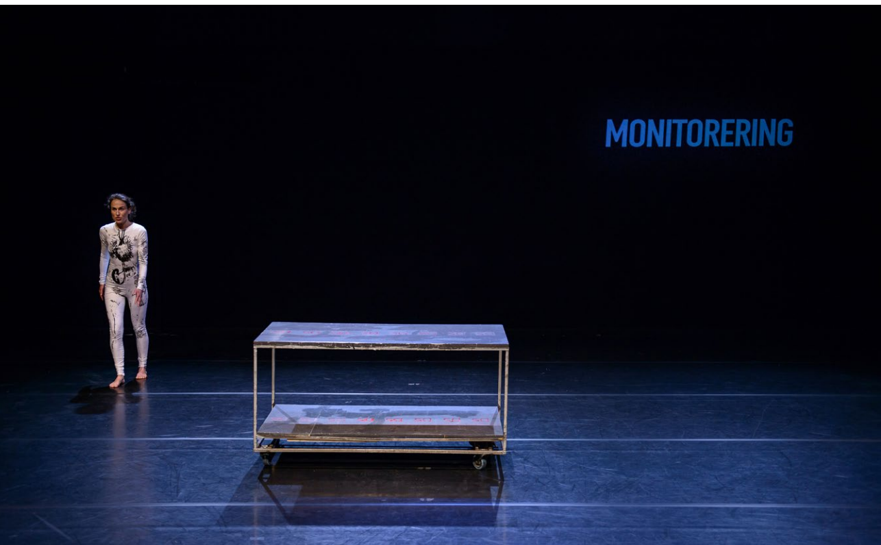
Figure 11 , from Precarious Life , 2014. Performance lecture in DanseHallerne.

Among the symptoms of autoimmune diseases are fatigue and depression, which, despite the increasing number of sufferers, are still not accepted in our contemporary high-efficiency society. In The Burnout Society philosopher Byung-Chul Han describes how the modern efficiency subject is in chains, just like Prometheus. 168 The subject exploits himself to an extent that leads to endless fatigue, which in turn is expressed in neurological disorders such as depression. Han identifies a positive potential to be found in fatigue as a character, a