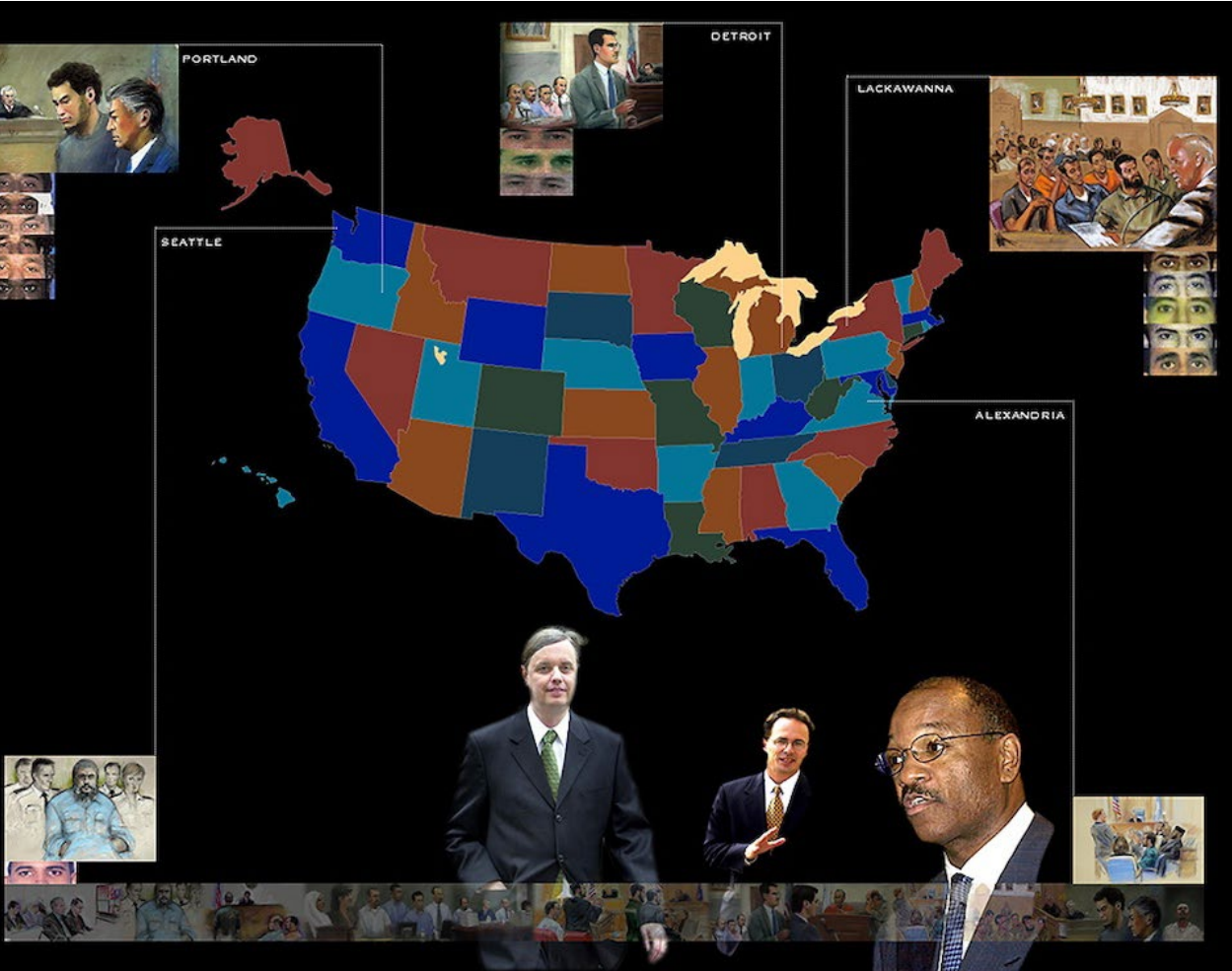
Figure 1 , Walid Raad, from I Feel a Great Desire to Meet the Masses Once Again , 2005. Performance with slide show produced by the Atlas Group. © Walid Raad and courtesy Paula Cooper Gallery, New York.