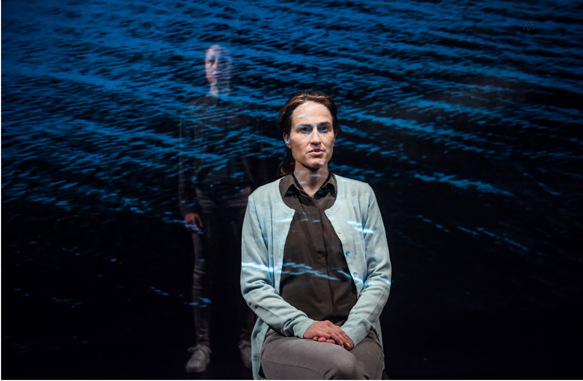
Figure 21 , from This is for her , 2017. Performance.