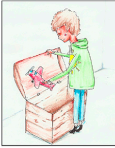
Child + experimenter watches