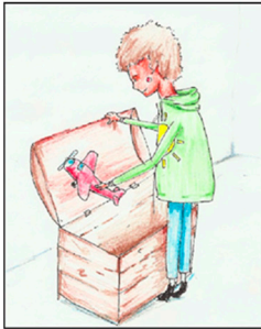
Child watches alone