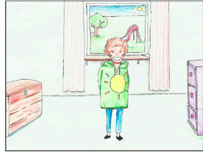
Experimenter asks – shared context