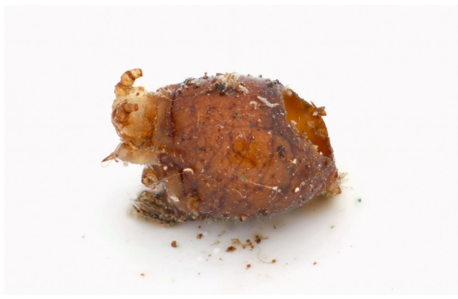
Fig. 5. The aphid Macrosiphoniella cf. abrotani . The damage shown on the dorsal part of the abdomen is probably an exit hole of a parasitic wasp.