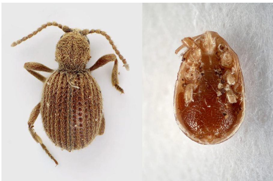
Fig. 3. The spider beetle Eupauloecus unicolor (left) and the mite Eulaelaps stabularis (right). The two most abundant species found in the coffin.