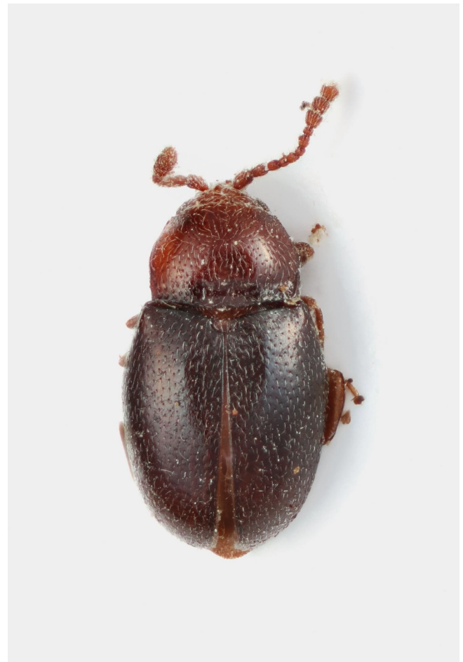
Fig. 4. The fungus beetle Atomaria nigripennis .

1979). The caterpillars of case-bearer moth Coleophora hemerobiella develop on leaves of fruit trees or shrubs of the Rosaceae, although identification of this larva is uncertain. Remains of Tinea pellionella and ichneumon wasps were also recorded.