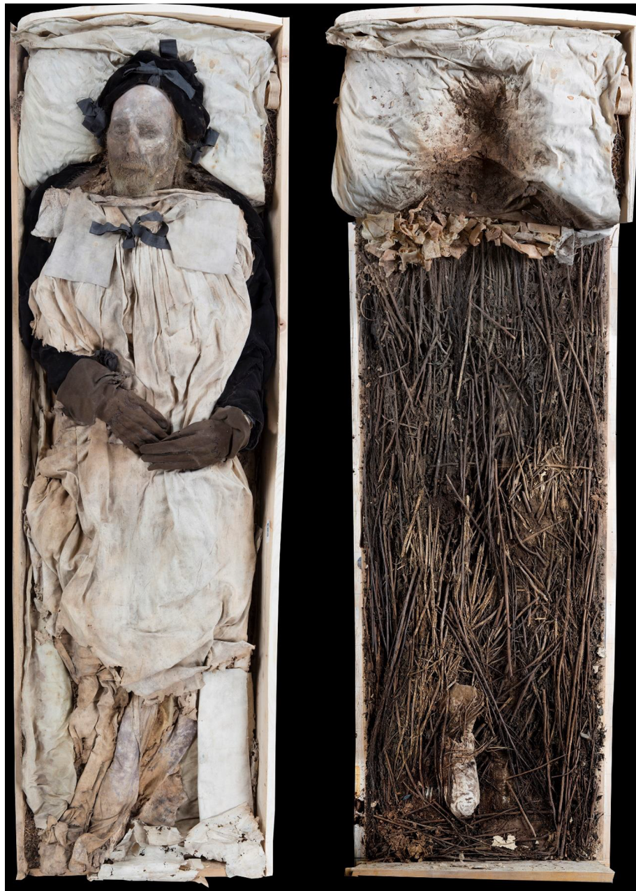
Fig. 1. Image of the bishop Peder Winstrup, when the coffin was opened (left). The bed of dried plants, mainly consisting of stems of Artemisia , which was exposed when the body and the mattress were removed (right).

17th century burial of Bishop Peder Winstrup, in Lund Minster, southern Sweden, and discuss the faunal significance for the archaeological context. The removal of the bishop's coffin in 2014 revealed an extraordinary preservation of the body and textiles, along with a large quantity of plant and invertebrate remains (Fig. 1). This has offered a unique opportunity to open a window into the 17th century world, and especially illuminate aspects which are seldom provided by historical sources or archaeological excavations.