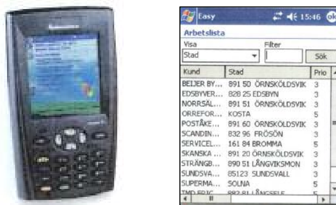
Figure 2. The actual handheld device and a sample screenshot from MobIS.

The workflow today is as follows: the ST receives the service order via the mobile device when it is synchronised, a routine that the technicians are instructed to do at least twice a day. The service orders are filled in via a touch screen and a pen, similar to a Palm Handheld. With this new routine, the workflow from a customer's call to a sent invoice is shortened significantly to an average of two to three days, sometimes up to four days.