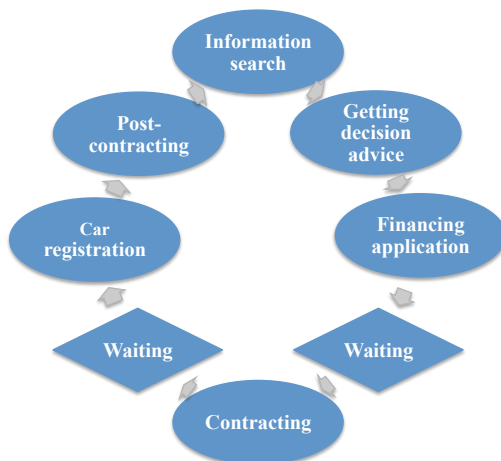
Figure 2: Customer Journey for car financing

Since The Company is a global actor, it was realized that their BCE concept was supposed to be applicable in all markets (i.e. countries). This further meant that there was no strict guide for how to implement it; this was up to each market to decide. The UK market had chosen to base their approach on painpoints in the customer journey, which are critical parts in the journey with improvement potential. An example of such a painpoint is lack of possibility to apply for financing online. Based on those painpoints they had set up initiatives, which in this case could be to develop an online application solution.